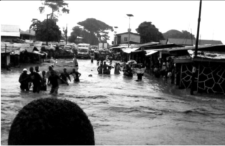
Fig. 3 In Sierra Leone, June to August is called "the hungry season," when heavy rains make it hard to harvest and obtain food.

Resource exploitation and extreme weather displaces farmers that practice mostly subsistence farming in rural communities. They have to venture deeper into forests in search of land and new livelihoods, bringing them in closer contact with infected animals (WHO 2015), while human activities cause bats and other animals to venture closer to human habitats.