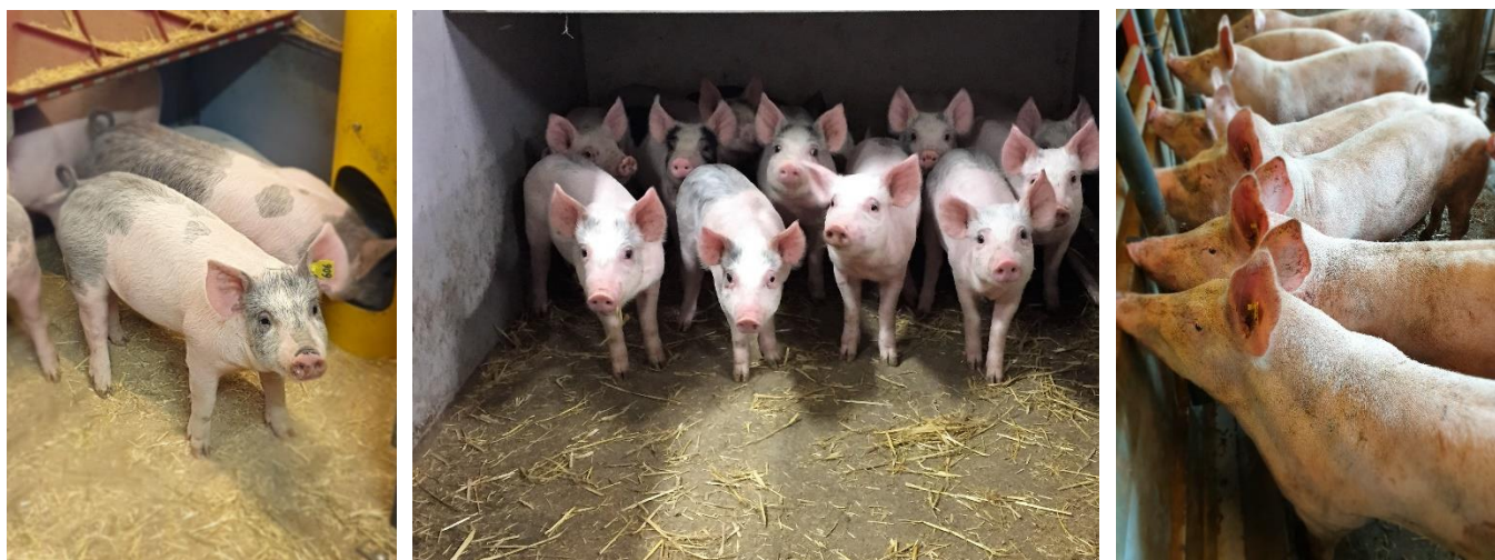
Figure 1: Growing finishing pigs: Photos: Magdalena Presto Åkerfeldt, SLU