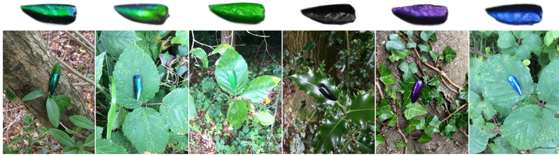
Figure 1. Prey Target Designs for All Six Treatments

From left to right: iridescent on privet, static rainbow on bramble, green on beech, black on holly, purple on English ivy, and blue on bramble. Also illustrated in these images is the varying level of specular highlights (gloss) between the different backgrounds.