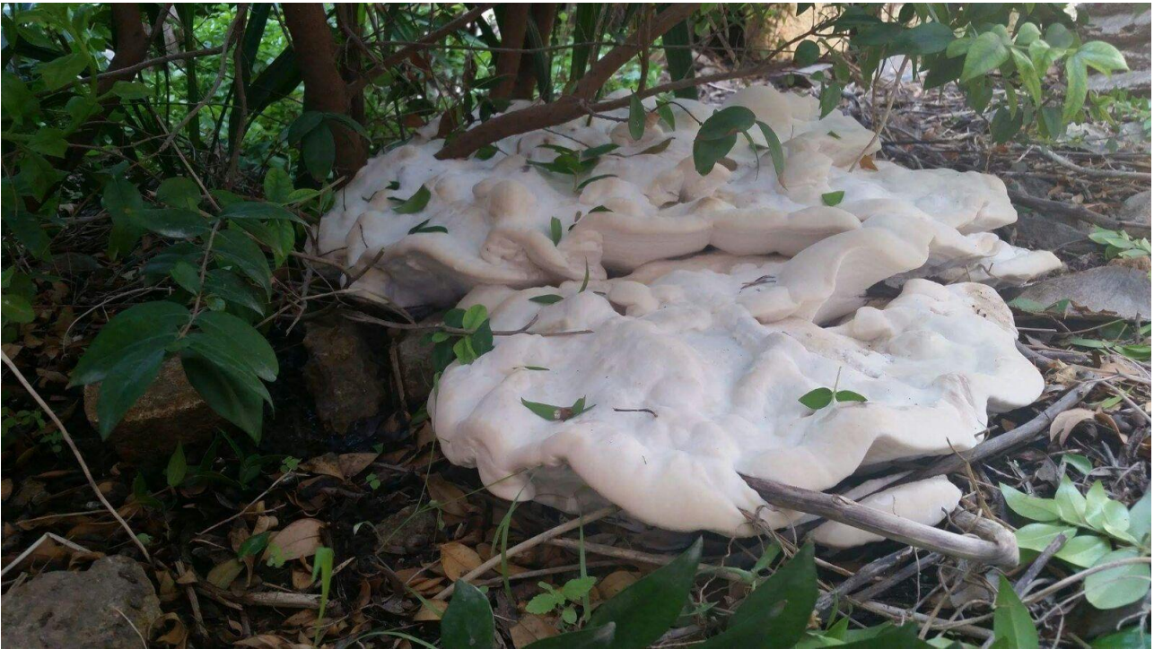
Figure 5 – Amylosporus campbellii . 5 Basidiomes in the habitat.