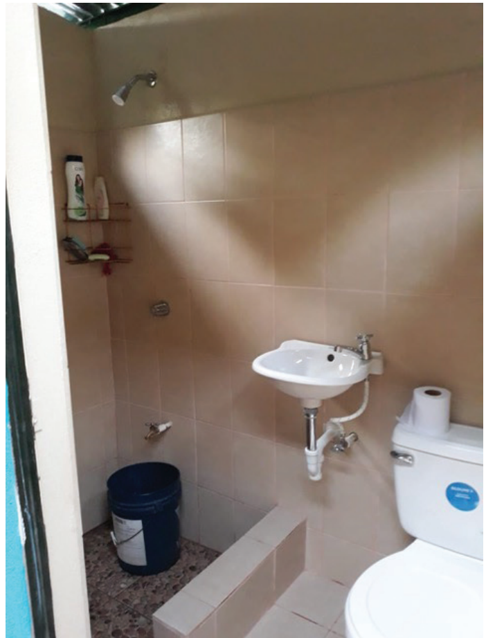
Modern bathroom in El Pedregal

Each of these goals has several activities to get us there, from testing people's poop and pee, lung capacity, urine density, etc. Our team of promoters are out spending their days working directly with community members. This partnership with communities lasts for 7 years which gives the community plenty of time to assimilate and take these projects over.