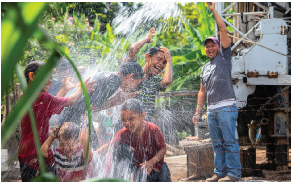
Happy faces when drilling was successful

The role of non-profit organizations in outfitting the developing world with clean water has become more extensive as the world's population grows, especially in places such as Nicaragua, the second poorest country in the western hemisphere. Nicaraguans suffer high rates of kidney disease, respiratory illnesses and parasites as a result of water borne diseases. NGOs such as Amigos for Christ are stepping in to fill the void in Chinandega where the local government lacks the financial wherewithal to provide a basic WASH infrastructure to its inhabitants. It is the goal of Amigos for Christ to bring water to every household in Chinandega thereby improving the health, education and welfare of the populace. This article is based on transcripts from an interview on how this NGO accomplishes their work.