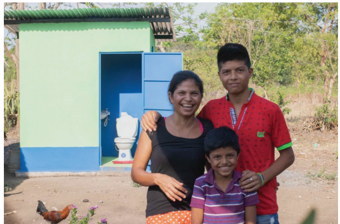
Family happy with great sanitation

In addition, we are in the process of working with Chosen Eye Mission from Texas to build a state-of-the-art eye surgery center that will be the best one in all of Nicaragua. We also host surgery teams from the U.S. for knee and hip replacements, as well as urology, gynecology, and general surgeries.