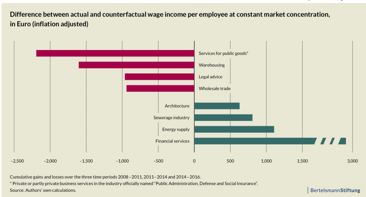
Figure 3: Wage effects that derive from changes in market concentration.

Even if the success of superstar firms is not due to unfair competition, one approach nonetheless involves regulation. Superstar firms with massive market power could make market entry more difficult for smaller firms that are potentially