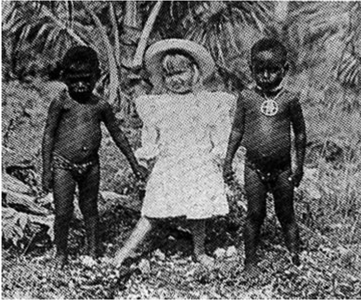
Plate 1. A Study in Black and White (Crown Studios, Sydney, c. 1908).

A few photographs that include both white and black children (such as Plate 1) most directly express the islanders' humanity. The remarkable "Study in Black and White," published as a postcard, differentiates the white girl, shown fully clothed, with a hat, from her two native friends, who are wearing only loincloths. Because all three appear to be barefoot, holding hands, and in the same basic group, the photograph seems to convey that they are all on the same level and in some sense have the same potential. This impression is strengthened by the fact that the picture shows only three children of more or less the same age and size. A similar message emerges from some larger, differentiated groups; but because these contain hierarchal differences based on age, the suggestions of friendship, voluntary association, and equality are submerged. It is, of course, difficult to see the picture in the way that a purchaser of the postcard in 1910 would have, but—