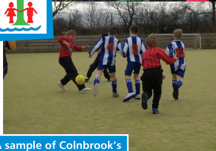
A sample of Colnbrook's SS programme: