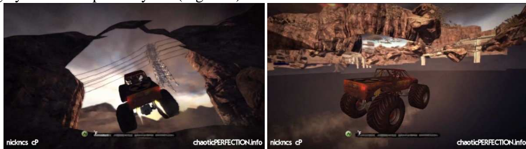
Figure 3 - Glitching Duke Nukem: conducting the barrier breaker and getting OOM.

The Monster Truck veers right and smashes headlong into the tunnel wall and instead of being repelled it truck flips upward and the rock wall becomes transparent (left, Figure 3), when the truck stabilizes it is outside the conventional playable game area and enters the strangely rendered space beyond (Figure 3).