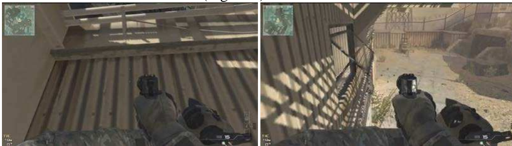
Figure 6 - Glitching BLOPs : Articulating Technique, Jump and crouch.

...you're going to do this kind of strafe-jump up there... then you've got to jump around the corner and crouch at the same time... (Figure 6)