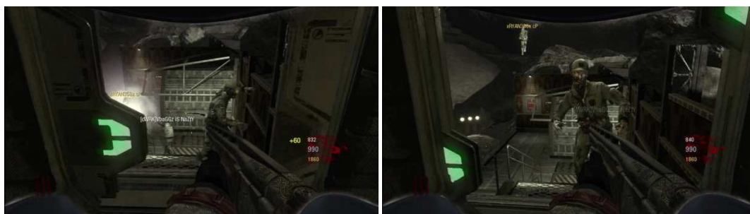
Figure 9 - Glitching CoD Rezurrection: A successful glitch process, no latent exploit.

Undeterred, the process was repeated, eventually the glitch was conducted as intended, the glitcher sailed high above the visible wall (Figure 4), highlighting the existence of a barrier beyond . That particular location was not susceptible to that glitch under those circumstances. Another location was selected and we began again.