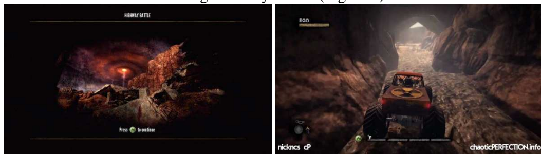
Figure 2 - Glitching Duke Nukem: approaching the glitch.

As music strikes up, the Duke Nukem: Forever loading screen is displayed and we watch as Duke drives his monster truck through a rocky tunnel (Figure 2).