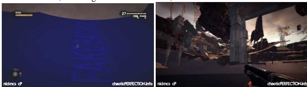
Figure 4 - Glitching Duke Nukem: the 'Fake Background' panel, and exploring scenery.

As the video continues the area outside the level is explored further, the player exits the vehicle and begins to shoot at level objects, drawing the viewer's attention to them – on closer inspection the scenery appears to have 'Fake Background' clearly written on it (Figure 4, left panel). The player continues, focusing on interesting and striking imagery. Eventually the music fades, the image dissolves to black, and the video finishes.