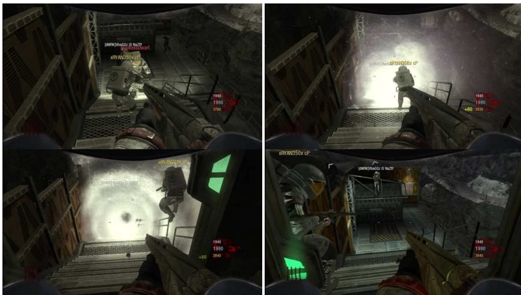
Figure 8 - Glitching CoD Rezurrection: testing the glitch hypothesis.

Following an initial exploration it was decided that the boss zombie should be lured into a position adjacent to an apparently low staircase barrier. It was hoped that the resulting explosion would send the glitcher up and over the wall, and hopefully OOM. Through careful maneuvering the zombies were separated and the boss zombie lured into the relevant (Figure 3). The resulting explosion launched the others into the air, one slammed into the doorway in front of me, while the other brushed against the wall, too low to confirm whether a barrier existed above the wall or not. It had taken perhaps twenty minutes and five restarts of the map to reach this point.