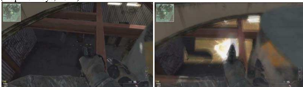
Figure 7 - Glitching BLOPs : Explaining outcomes and uses.

...I recommend being on default button layout because you've got to crouch immediately after... once you're up here you can just hang about, climb all over the dome... stand on those little red bars... it's a good spot for infection if you guys play that... (Figure 7) (mapMonkeys, 2011).