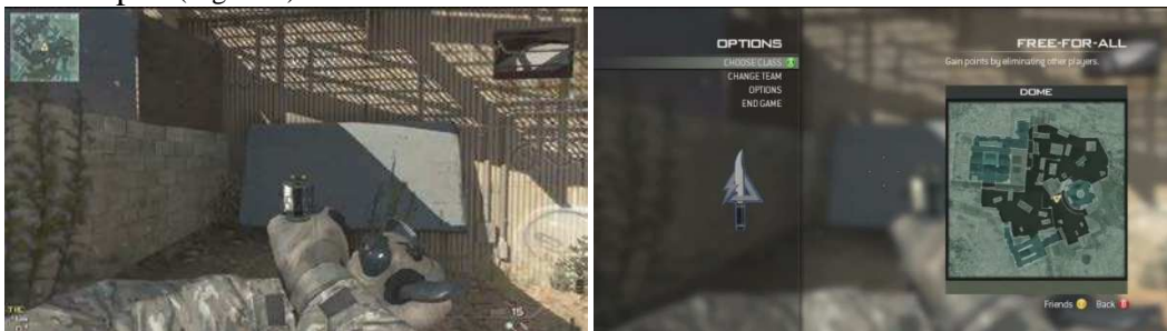
Figure 5 - Glitching BLOPs : Identifying location.

'Hey mapMonkeys, it's your boy Sewerwaste here... on Dome you're going to come to this part of the map... (Figure 5)