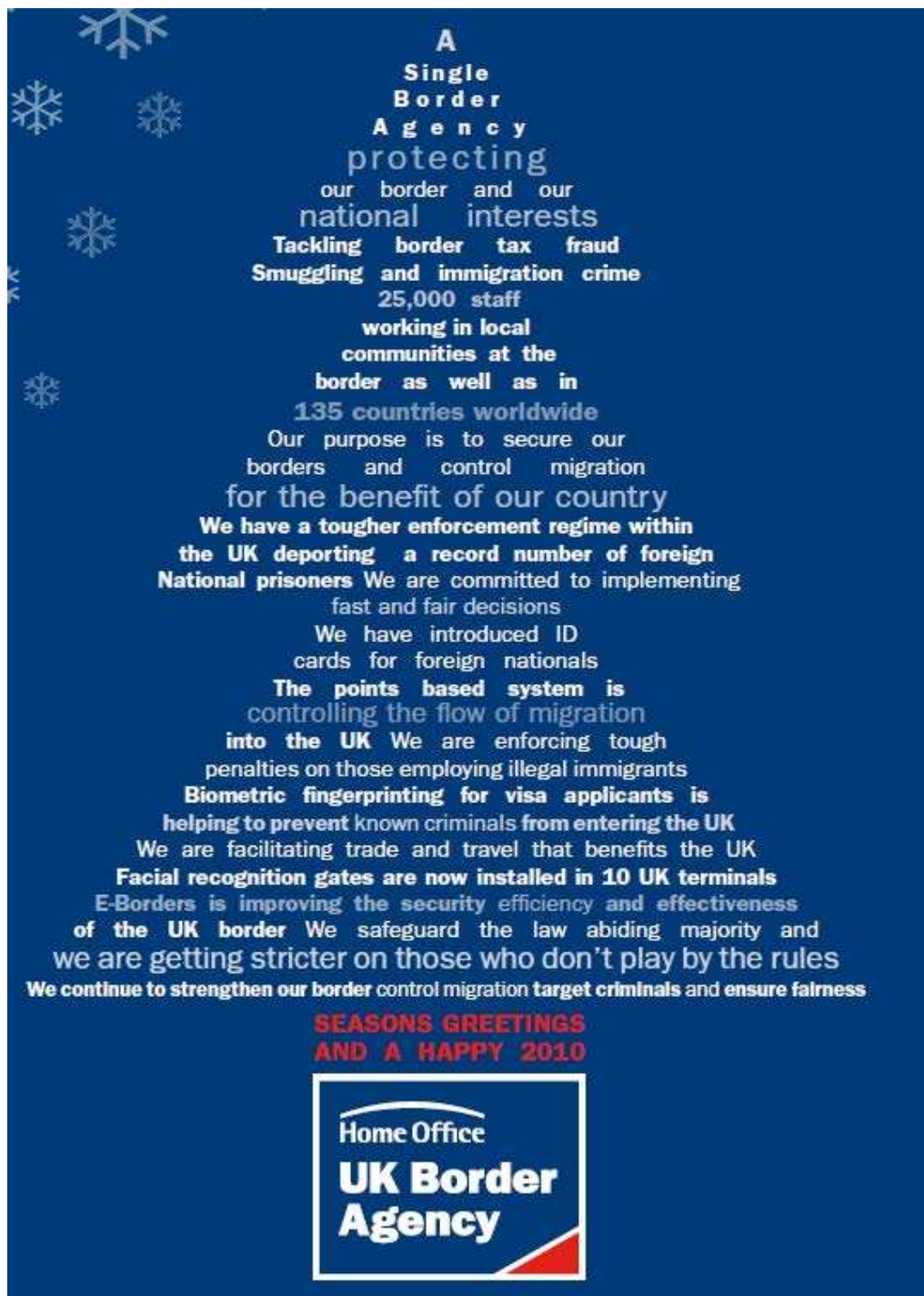
Figure 2: Christmas Card received by the researcher by e-mail from the UKBA (UKBA, 2009b) | (e

example would be the e-Christmas card I received in December 2009 which was the mission and purpose of the UKBA in the shape of a Christmas tree. This is included as below as Figure 2. I found the message within the card is aggressive, negative and threatening. It portrays the UKBA as an agency to be feared (Journal, December 2009 150 ).