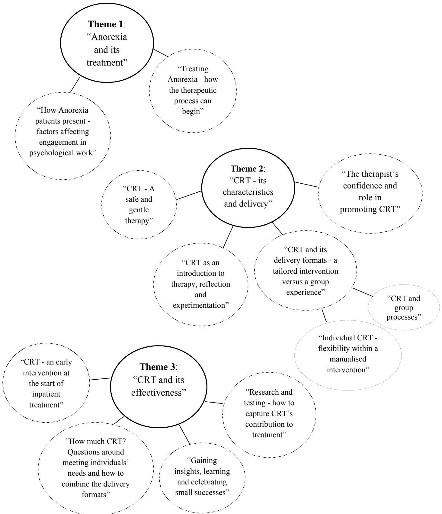
Figure M1: Thematic map of the themes and subthemes from the thematic analysis.