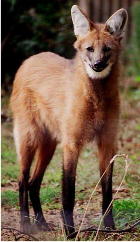
Figure 1. The maned wolf, photo from Questionnaire 1. (The Ark Gallery, Durrel Wildlife Conservation Trust)