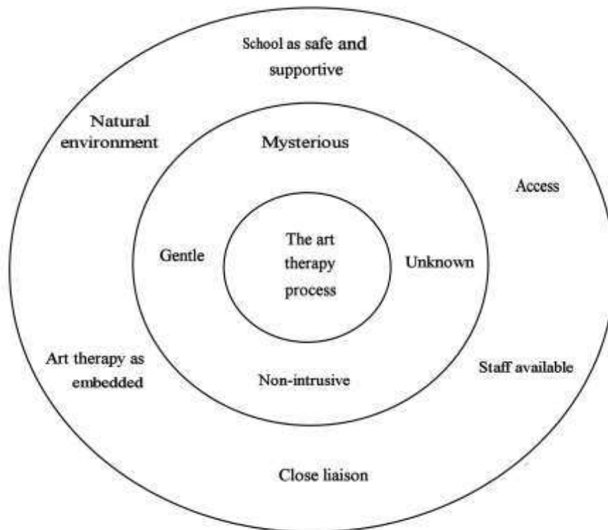
Figure 1: Model component 1 - The context for therapy