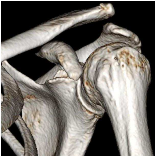
Figure 5: Computed Tomography Scan Three Dimensional Reconstruction.