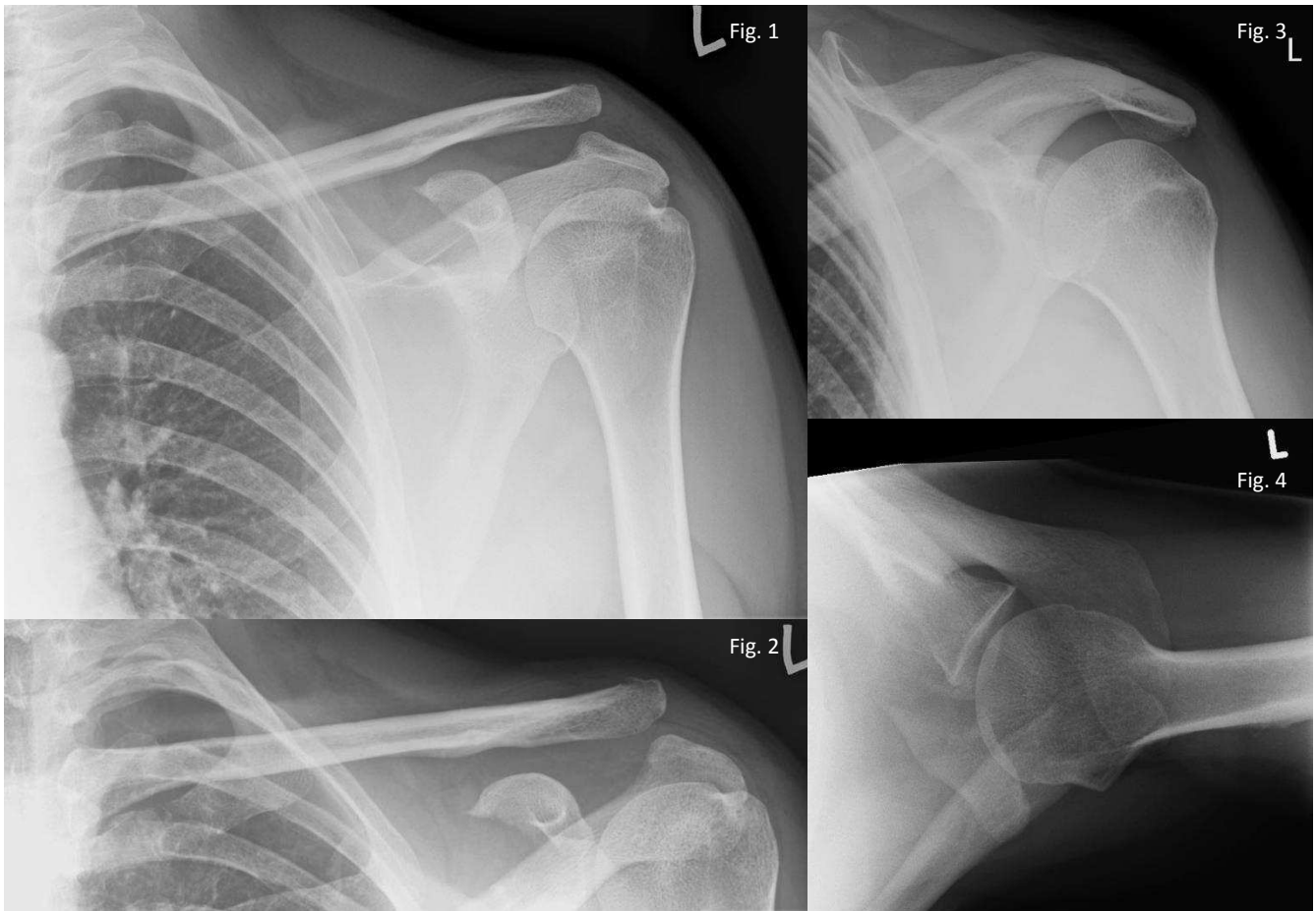
Figures 1-4: Initial X-ray Examination Images

Fig. 1: Anteroposterior Shoulder Projection.