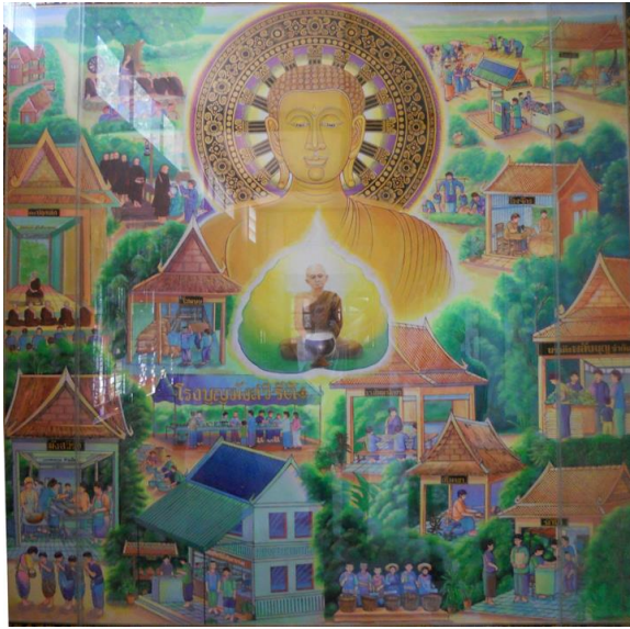
Illustrations 1 and 2: Asoke worldview diptych at Sisa Asok (2012)