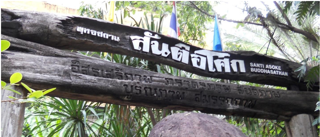
Illustration 3: พุทธสถาน สันติ อโศก Santi Asoke Buddhist Centre, entrance arch

According to Heikkilä-Horn (1997), the key Asoke values include nature and the natural, compassion and kindness, whilst the values that they oppose are luxury, wastefulness, and laziness. Metta should be shown to all that lives through veg(etari)anism. The Asoke group embrace natural agriculture, natural food, clothes, eating utensils and building materials. They practice modesty through simplicity in eating, clothing and housing, opposing luxury, which they perceive to be superfluous, wasteful, and against the Buddha's teaching on necessities (medicine, food, clothing, and housing). Devotion is to society, work and the Asoke group. For Asoke members, work is meditation. Every moment should be meditation through concentration, consciousness and awareness of the world (Heikkilä-Horn 1997). This is an example of what Buddhist-communist mindfulness can look like.