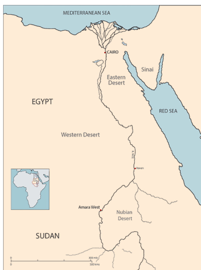
Figure 1: Location map of Amara West, northern Sudan (map: Claire Thorne).

The thirteen humeri form part of a large assemblage of faunal remains from the site of Amara West in northern Sudan (Figure 1). Founded c.1300 BC, and occupied through until around 1000BC, the town was founded as a new administrative centre to oversee the pharaonic colony of Upper Nubia (Kush). The settlement (including its cemeteries) has been the focus of a British Museum research project since 2008, under the direction of Dr Neal Spencer (see Spencer 2014; Spencer, Stevens, and Binder 2014).