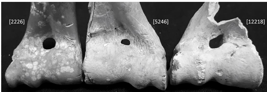
Figure 2: Supratrochlear foramina of the humerus in two goats (AW2 [2226]; AW8 [5246]) and a sheep/goat (AW12 [12218]) from Amara West. From left to right: round, oval, and irregular.

having clearly defined edges, these were fragile and more prone to damage (e.g. Figure 2, AW8 [5246]).