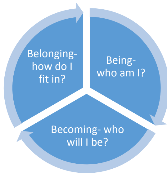
Figure 1 Conceptual Frame of Being, Becoming and Belonging.