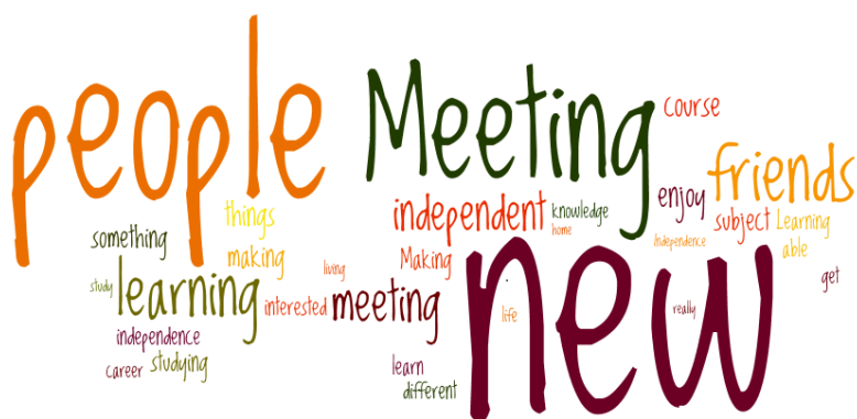
Figure 2: Word Cloud- 30 most frequent words about the best things about coming to university