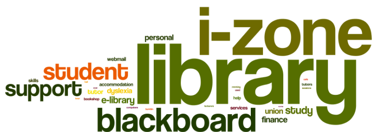
Figure 6: Word Cloud- 30 most frequent words about what university services accessed

words about what helped students to 'belong'