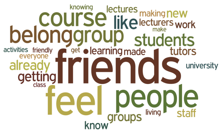
Figure 5: Word Cloud- 30 most frequent

words about what helped students to 'belong'