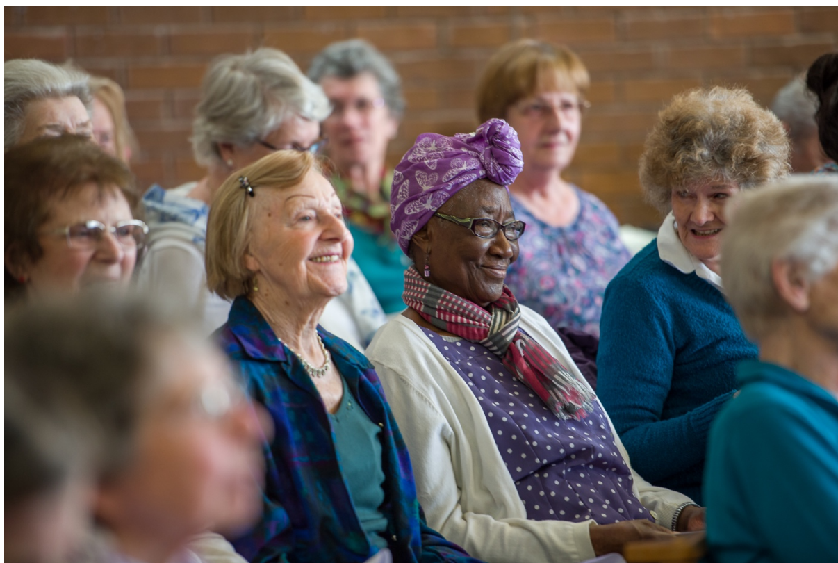
Figure 5: Generic singing for health group, 2017, Kent, United Kingdom

A striking feature of the generic group used in this study was the business-like approach adopted by founding members, who formed a committee, developed a constitution and sought advice from an external body as to how their choir might develop a sustainable model of delivery. This approach was instrumental in their ability to manage rapid growth in membership and pay an acceptable rate of remuneration to both a musical director and accompanist. However, the group has also received monetary awards from local funding bodies that have provided invaluable help in providing a sustainable community health service. Their experience suggests that singing groups can be sustained through member subscription, with the addition of short-term funding streams.