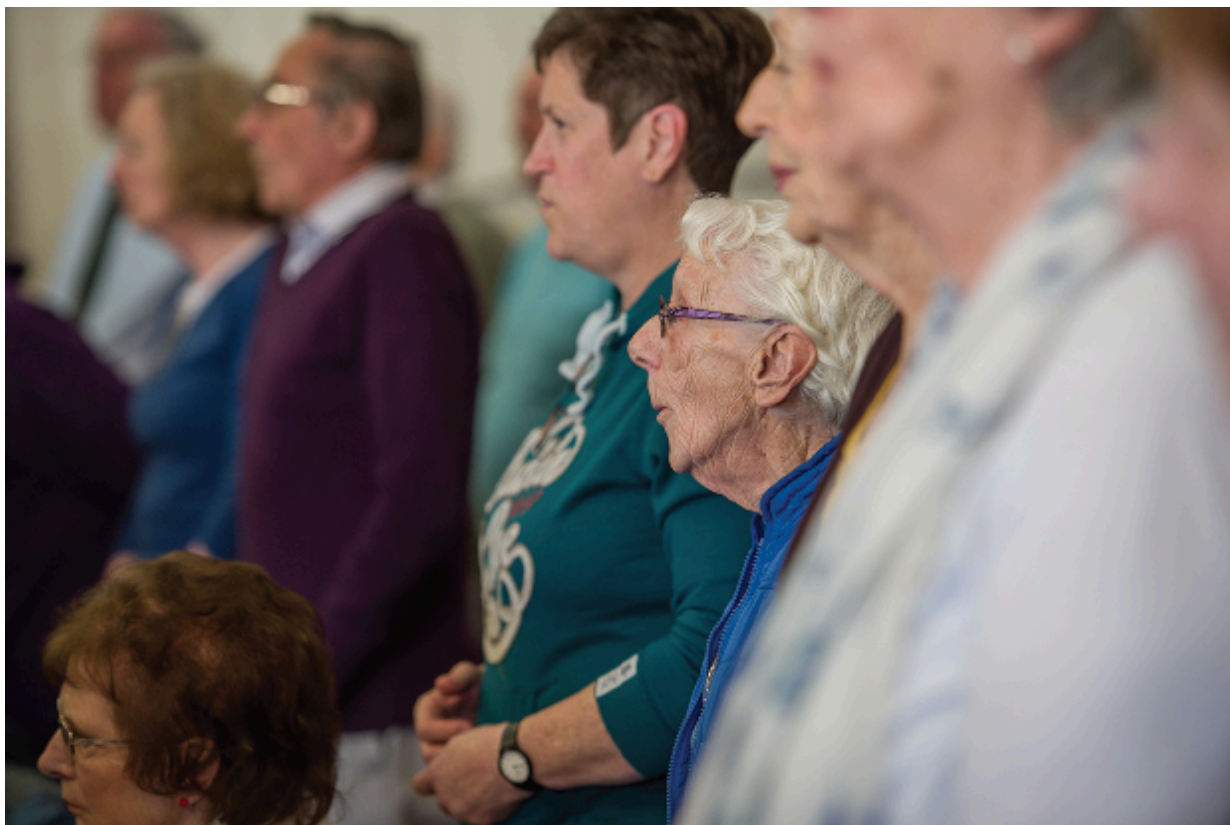
Figure 3: Generic singing for health group , 2017, Kent, United Kingdom

Additionally, another member succinctly captured the benefit, in their opinion, of meeting a wide range of different people: ‘The choir is my only social life, so meeting a range of different people is very important’ (female, 74, respiratory disease).