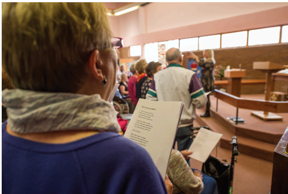
Figure 4: Generic singing for health group , 2017, Kent, United Kingdom

A comparative formal study of participants with Parkinson's attending weekly singing sessions is yet to be undertaken, but a guide document 'Singing and people with Parkinson's' has been produced by the Sidney De Haan Research Centre for Arts and Health, England, UK, which provides qualitative data from several studies and research evidence used within this study as comparative data. Participants reported that singing provided benefits to both their physical and mental health (Table 2).