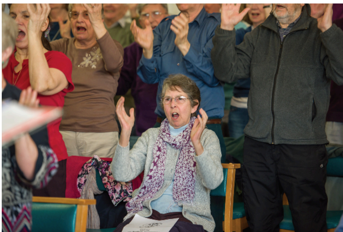
Figure 1: Generic singing for health group , 2017, Kent, United Kingdom, © Sonia Price

Studies concentrating specifically on the benefits of group singing for older people have reported improvements in mental health (Sakano et al. 2014), self-development and sense of community (Teater & Baldwin 2014), and physical health, cognitive stimulation and memory (Skingley & Bungay 2010).