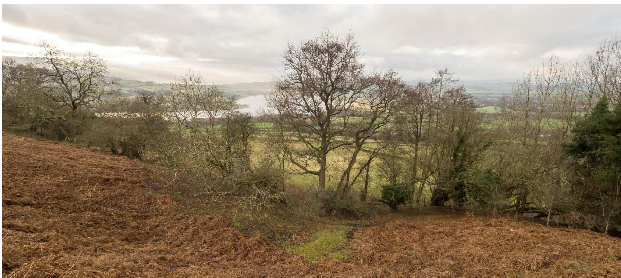
[Figure 4: Llywarch Hen's dyke (topped with trees) running from left to right, with Llangorse Lake in the background. The second of the three springs marked on Figure 1, rises in the foreground and flows down towards the lake.]