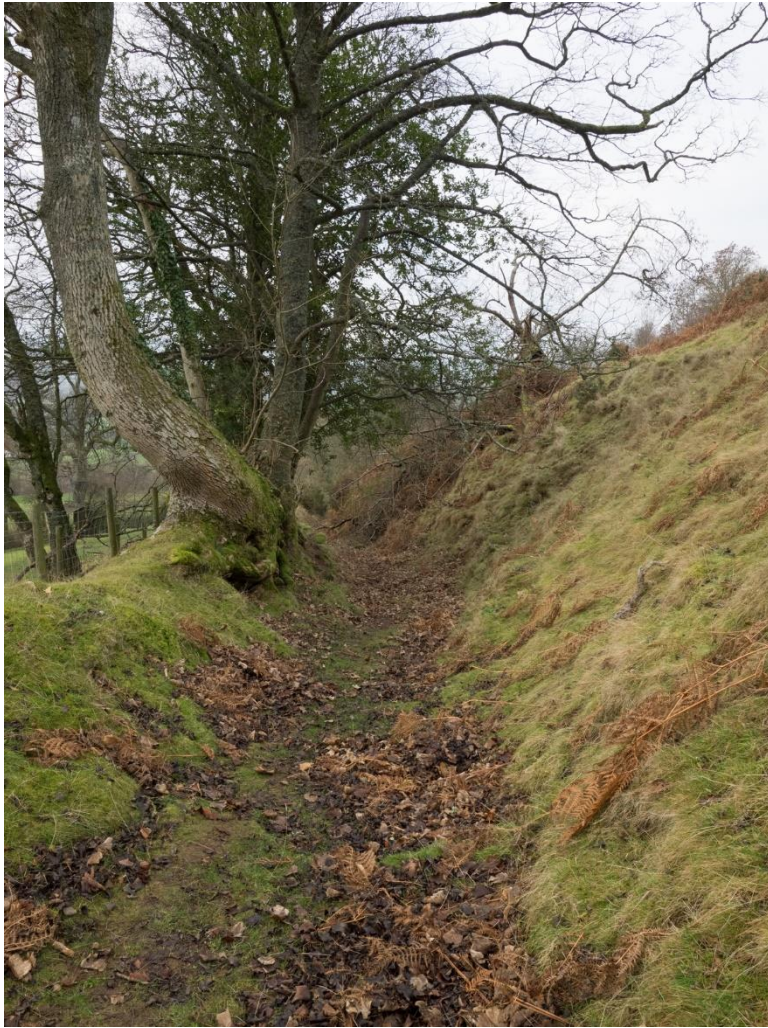
[Figure 3: Section of Llywarch Hen's Dyke, looking north. The open pastures of Mynydd Llangorse are to the right.]