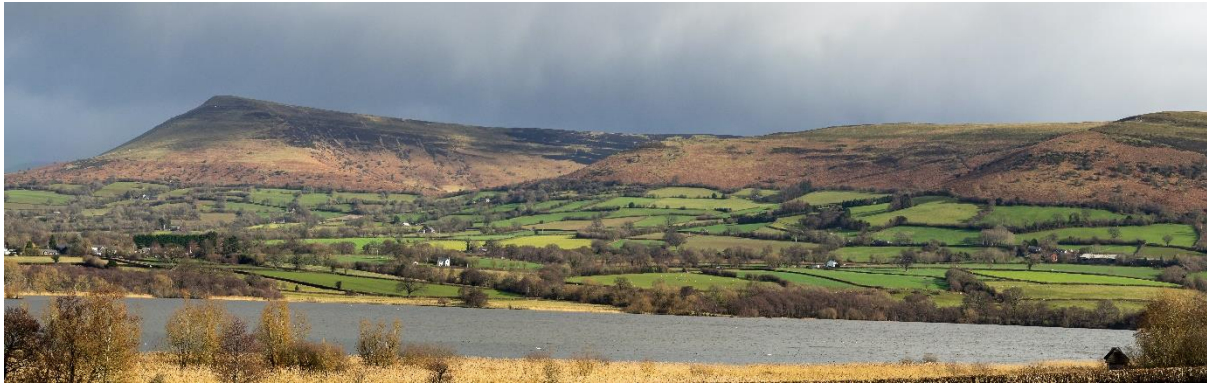
[Figure 5: The pen-clawdd demarcating the edge of the open pasture as seen from the south west side of the Llangorse Lake.]

In the absence of any information from excavations it is very difficult to determine the date at which the dyke was constructed, but the system of infield-outfield agriculture to which it belonged is likely to have predated the early medieval period ( cf. Cunliffe 2009: 57, 60). Indeed, its origins may lie in the early Roman period, when a record of sedimentation observed in a core taken from Llangorse Lake suggests there was an increase in woodland clearance and arable activity, indicating a related reorganization of farming systems at this time (Chambers 1999: 354–55; Jones et al. 1985: 229, 234).