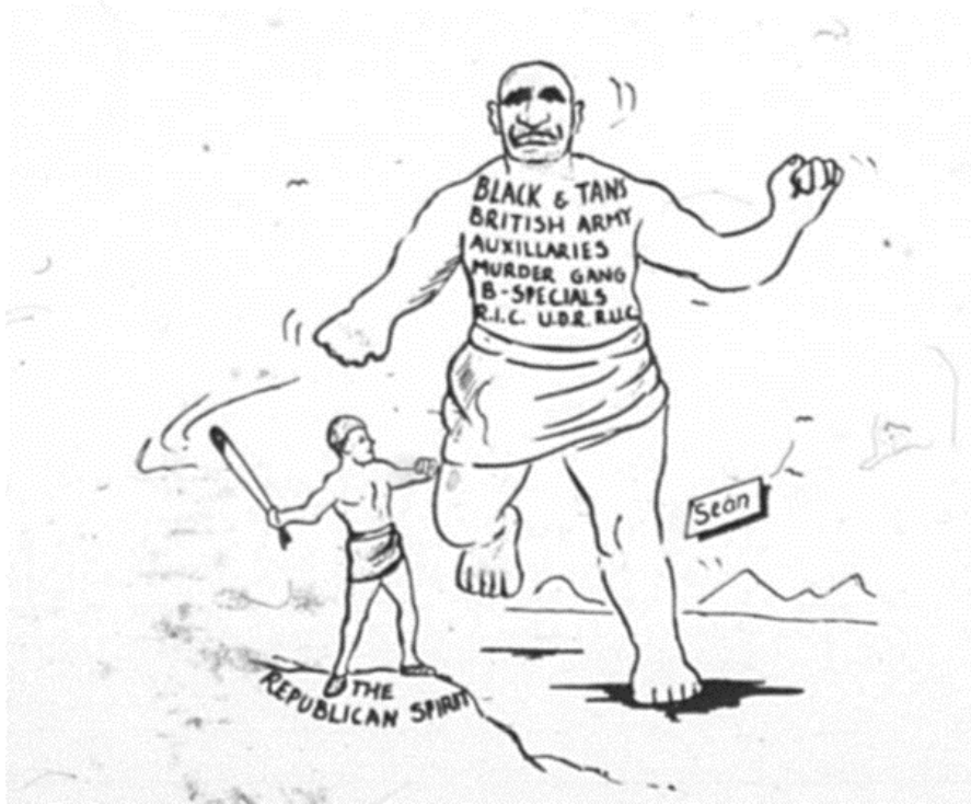
Figure 1: The goliath task facing republicans. Republican News , May 1971.