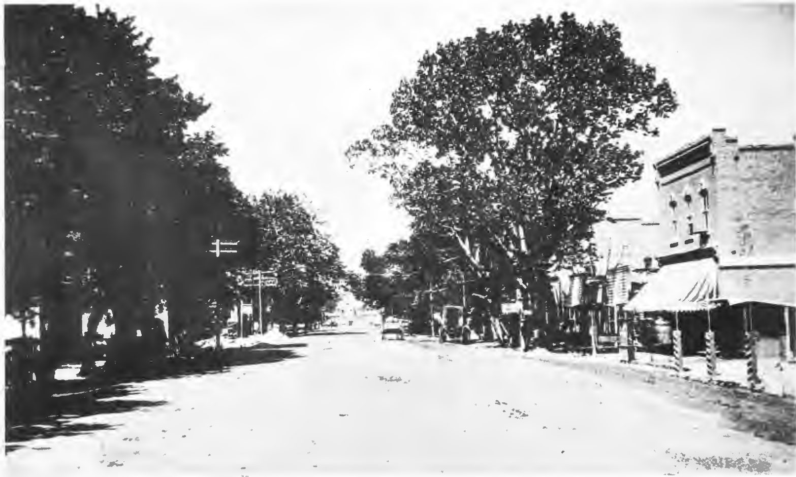
Figure 1. Looking west on Twenty-fifth Street.