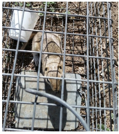
Piute ground squirrel caught in a live animal trap.

Trapping. Trapping squirrels work well in towns, around homes, and in areas where you are not able to use baits and fumigants. These are situations where there are a few squirrels present, rather than an entire colony. Research has shown that when trapping Piute ground squirrels, you should use fresh