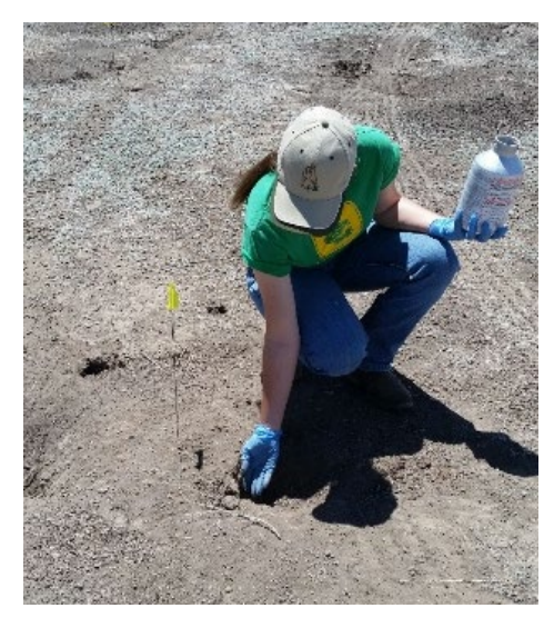
Putting Aluminum Phosphide tablets in ground squirrel burrows.

permitting them to react more readily with the atmospheric and soil moisture. It is the reaction with moisture that produces the lethal phosphine gas.