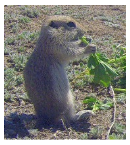
Piute ground squirrel eating alfalfa.

The Piute ground squirrel eats grasses, seeds, alfalfa, other agronomic crops, and sometimes meat. The species mates in late winter or early spring, and females produce a litter of five to ten young about 24 days after mating. Because of its affinity for crops, the Piute ground squirrel can cause a great deal of agricultural damage in areas with large populations.