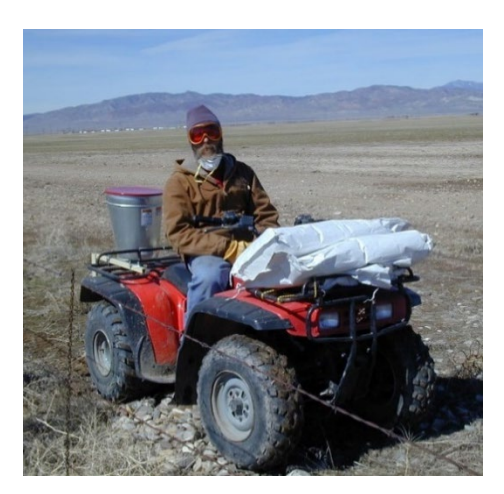
Producer applying bait using a 4-wheeler.

Anticoagulant baits generally require 2 to 4 weeks or more to control populations. Continue baiting until all feeding ceases and you no longer see any squirrels. Although most animals will retreat below ground as they feel ill, a few ground squirrels will die above ground. Wearing gloves, you should pick up and dispose of those that do by placing them in a closed waste bin or burying the carcass underground. Also, be sure to pick up and dispose of unused bait upon completion of the management program, according to label instructions.