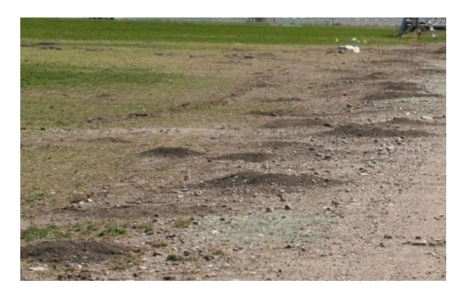
Damage caused by Piute ground squirrels in alfalfa field.

Ground squirrels eat alfalfa, grasses and other agronomic crops. The reduction in alfalfa and other crop yields and the cost of controlling the squirrels exceeds hundreds of thousands of dollars annually. They also destroy golf courses, and lawns; and can be reservoirs for diseases such as plague. Their burrowing activities can weaken and collapse ditch banks and canals, undermine foundations, and alter irrigation systems. Burrow mounds not only cover and kill vegetation, but damage haying machinery. Piute ground squirrels in Utah are not a protected species. However, before initiating any lethal control measures consult with your USU County Extension Agent.