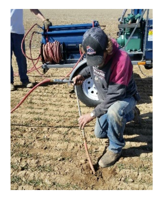
Using PERC machine to fumigate squirrels.

Fumigation is most effective in spring, or at other times when soil moisture is high, such as immediately after