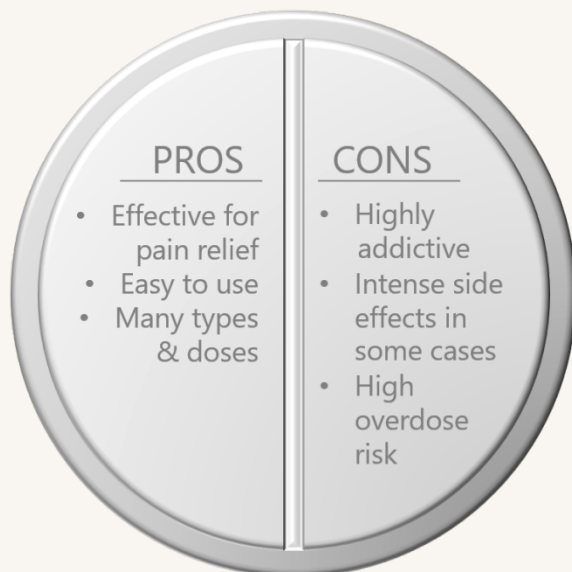
Figure 2. Pros and Cons of Opioid Usage for Pain.

As such, opioids may not be the best option for patients seeking cost-effective, long-term treatment (Gatchel, et al., 2014). Opioids, including prescriptions, are extremely addictive in nature. If opioids are not used as prescribed, they could lead to a dangerous overdose. According to the Center for Disease Control and Prevention (CDC) over 70,000 people died of an overdose in 2017 in the United States, almost 70% of these overdoses involved an opioid (Scholl, et al., 2019). In addition, commonly-prescribed opioid medications alone are generally not enough to impact or improve physical and emotional function of most patients suffering from chronic pain (Turk, et al., 2011). Figure 2 summarizes the pros and cons of opioids, and why they are likely not the best choice for long-term pain management.