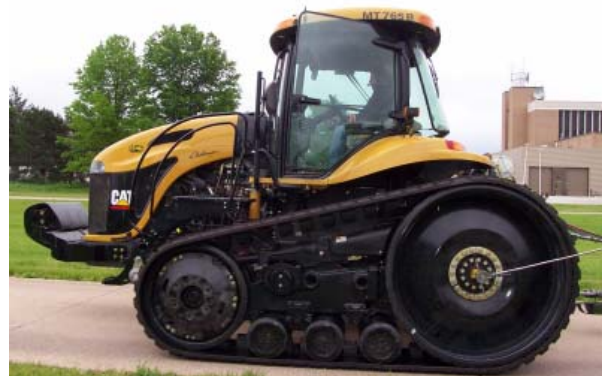
CHALLENGER MT765B DIESEL