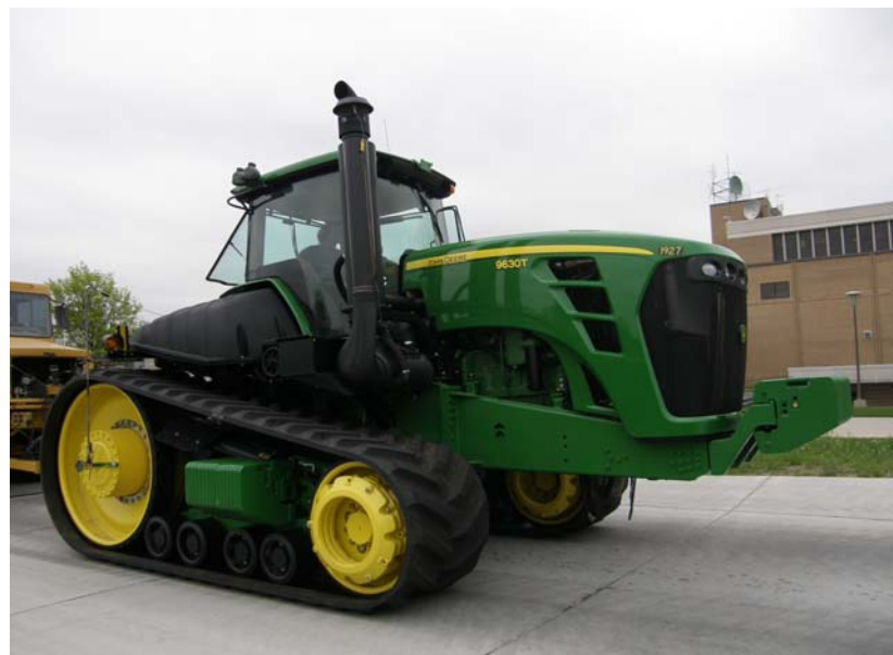
JOHN DEERE 9630T DIESEL