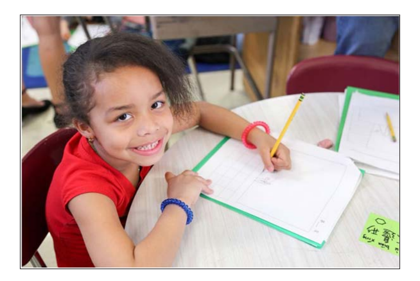
Figure 3. This student in Manhattan's P.S. 1 is learning both English and Mandarin as part of the school's Dual Language program. Source : NYC Department of Education. Reproduced with permission. Text 25: <a href="https://morningbellnyc.com/wp-content/uploads/2018/05/1dc4b13a-c942-4490-a74b-70d12dd7fb21.jpg">https://morningbellnyc.com/wp-content/uploads/2018/05/1dc4b13a-c942-4490-a74b-70d12dd7fb21.jpg</a>

Figure 3 is one of very few images found in which there is interaction with the viewer through the emotional process of smiling. Although the camera takes a slightly downward angle, the photo is a close-up, and conveys intimacy. In addition, the sweet smiling face of the girl (who is most likely not a heritage learner of Mandarin given her physical characteristics) through her direct gaze