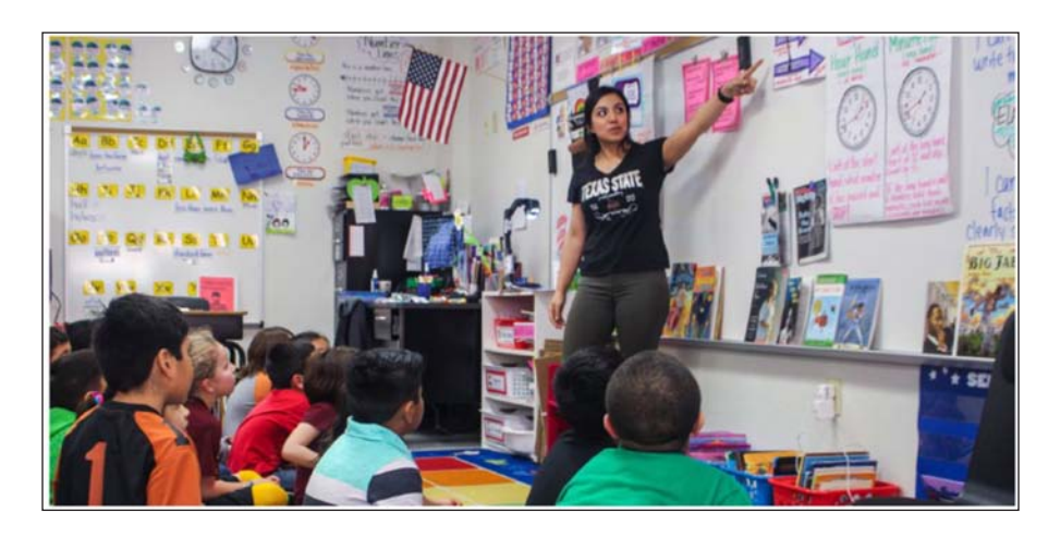
Figure 2. Text 4: <a href="https://communityimpact.com/austin/san-marcos-buda-kyle/education/2018/03/19/hays-san-marcos-cisd-dual-language-programs-grow-officials-look-ways-around-bilingual-teacher-shortage/">https://communityimpact.com/austin/san-marcos-buda-kyle/education/2018/03/19/hays-san-marcos-cisd-dual-language-programs-grow-officials-look-ways-around-bilingual-teacher-shortage/</a>

(identified as second graders in the caption) who are looking at the teacher and the chart. The room is full of typical icons of educational settings such as word charts, bulletin boards, pictures, the alphabet, clocks, cubbies to store things like crayons, and various picture books. However, there is nothing in the photograph that further explains or illustrates the focus on teacher shortage in the article. Instead, Figure 2 is a typical large group photo that emerged in the data depicting Spanish-English programs (and occasionally French or Mandarin) which followed a similar pattern: a long-distance camera shot of the teacher pointing at something or writing on the board, students' backs to the camera, no gaze or direct engagement by the subjects with the viewer, and downward camera angles which indicate symbolic power over someone (Van Leeuwen, 2008). It projects a traditional image of a teacher as an authority figure because she is physically and symbolically above the students. In addition, it gives a vague portrayal of what is happening in the DL program (or what the district is doing to solve the teacher shortage problem).