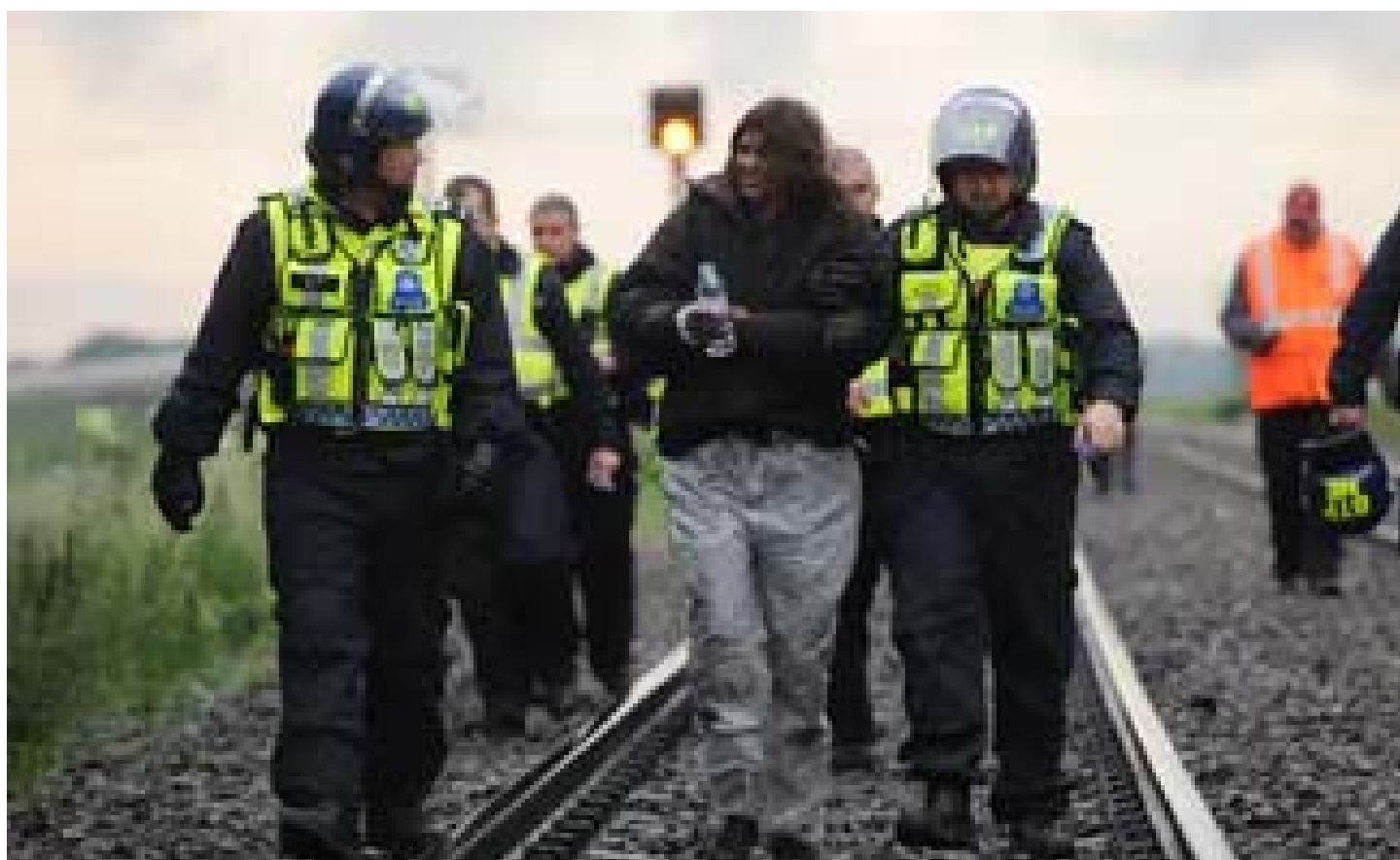
The shocking and immoral behaviour of the British secret police