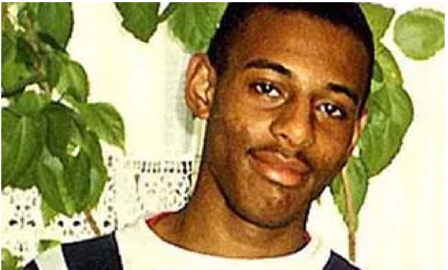
Stephen Lawrence: his death changed British law forever but trust in police has yet to recover