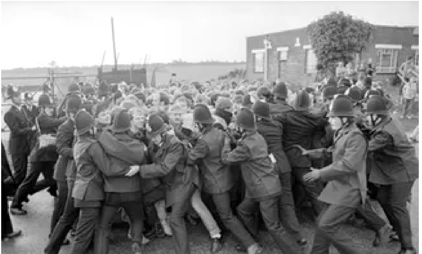
War on the picket line: how the British press made a battle out of the miners' strike