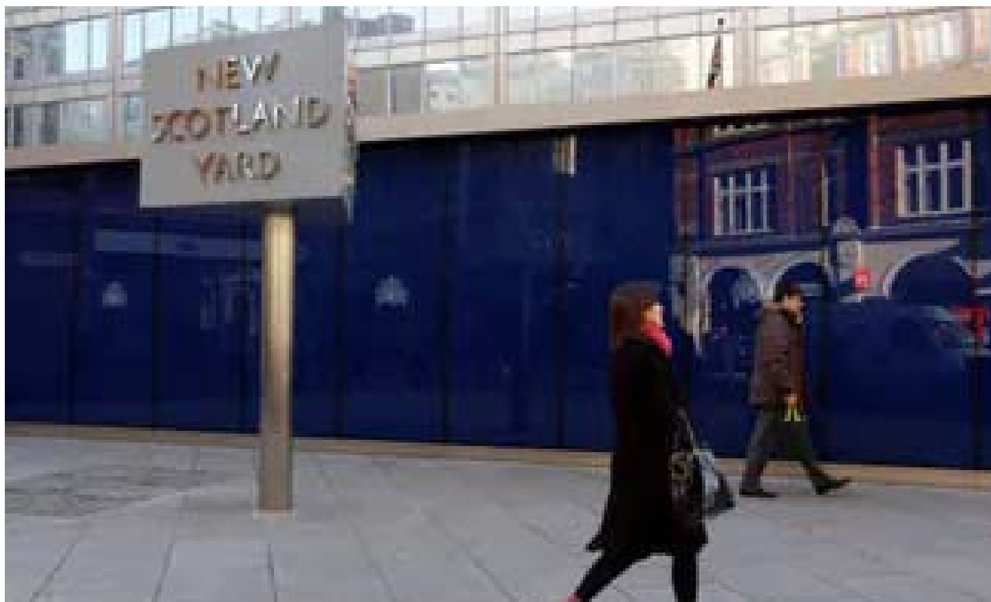
Undercover policing is a necessary evil – but we must learn from its mistakes