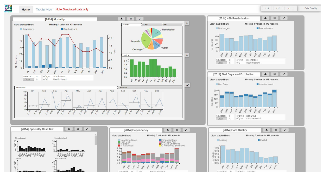
Figure 1 Prototype of main dashboard view for the paediatric intensive care audit network (using simulated data).

with NCAs mean the potential for NCA data to inform QI is not being realised. ^{67}