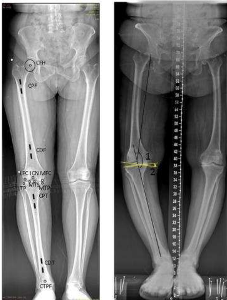
Fig. 1. Following landmarks were identified manually through the software for each limb. Centre of the femoral head (CFH), centre of the proximal (CPF) and the distal third of the intramedullary canal of the femur (CDF), medial femoral condyle (MFC), the intercondylar notch (ICN), lateral femoral condyle (LFC), medial (MTP) and lateral tibial plateau (LTP), medial (MTS) and lateral tibial spine (LTS), centre of the proximal (CPT) and distal third of the intramedullary canal of the tibia (CDT) and the centre of the tibial plafond (CTPF). With the help of these landmarks following angles were calculated. Hip-Knee-Ankle Angle 1 ; the angle subtended between the line connecting CFH, ICN and point between MTS and LTS and CTPF, Condylar plateau

and inferior aspect of lesser trochanter along with a point 5 cm distal to the latter was used for proximal femur. Two mid-cortical point proximal to MFC at 5 and 10 cm and ICN was used for distal femur. For proximal tibia, mid-point between MTS and LTS was taken as the first point along with two mid cortical point at 5 and 10 cm distal to MTP and for distal half the first point taken was CTPF along with two points which were 3 and 5 cm proximal to it. Using these landmarks the following parameters were calculated.