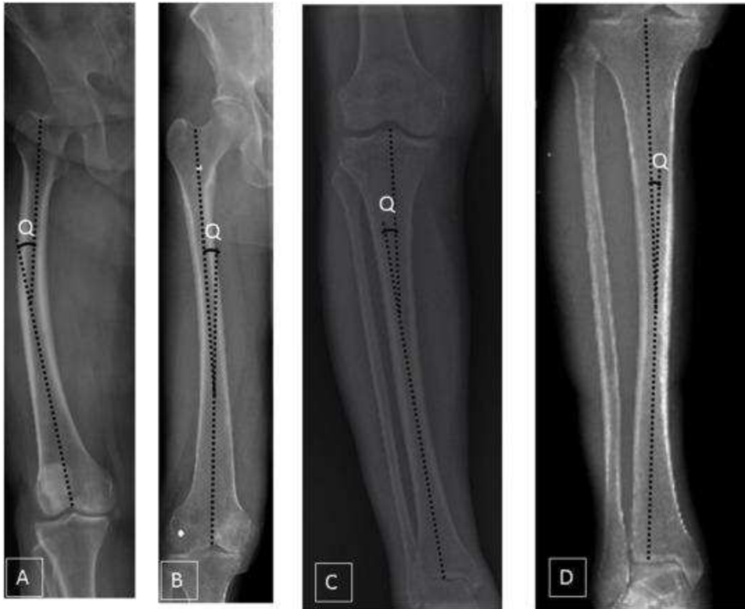
Fig. 2. Bowing was calculated from the angle formed between the line connecting proximal and distal mid-cortical centres for both femur and tibia (Q). It was defined as vara if there was a lateral bowing greater 2^{\circ} (A,C) and valgus if there was medial bowing greater than 2^{\circ} (B,D).