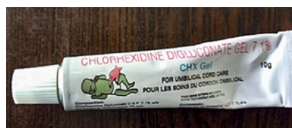
Chlorhexidine ointment can be mistaken for eye ointment.

mHealth applications might increase efficiency of reporting. In this instance, we have used mHealth and social media to publicise and discuss the issue within the eye care community.