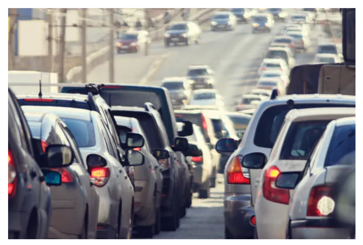
Reducing congestion and air pollution requires fewer cars.

Experts from the Cosmopolis Centre in Brussels agree that the effects of free public transport on car traffic levels are marginal, arguing that by itself free public transport cannot significantly reduce car use and traffic, or improve air quality.