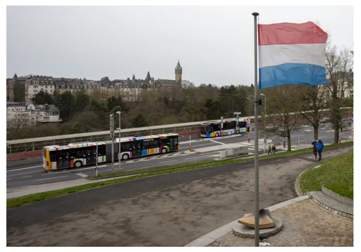
Luxembourg is the first country in the world to abolish public transport fares nationwide.