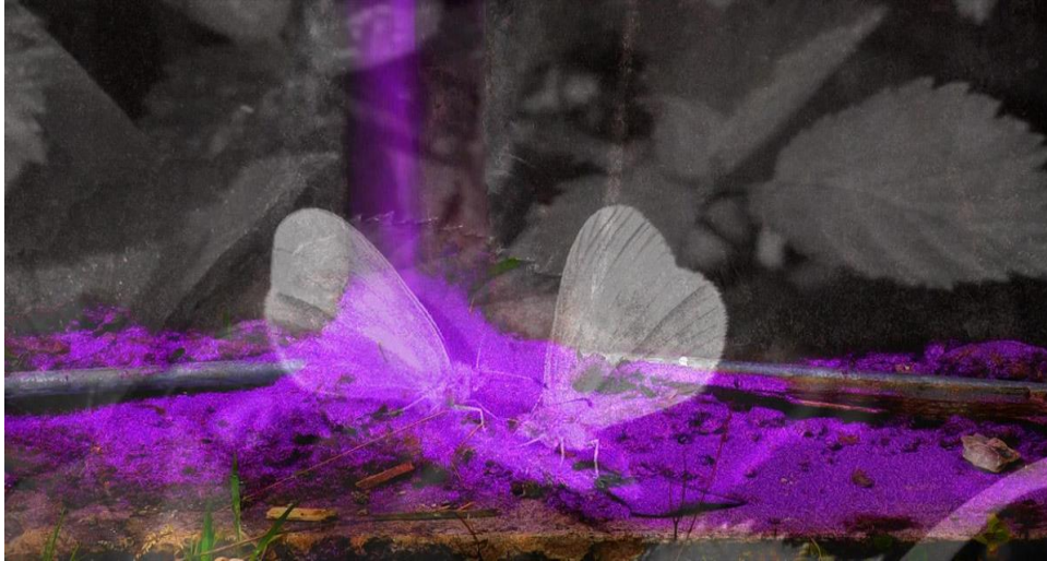
Figure 5: The Territories of Eile, audiovisual film, 2018, film still. [by a place of their own]