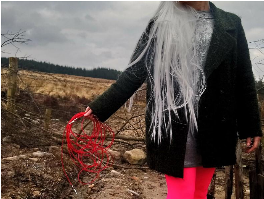
Figure 8: The Territories of Eile #4 Bog, audiovisual film, forthcoming 2020, film still. [by a place of their own]

visual arts. Bog peatland are among the most valuable ecosystems on Earth: they have a critical role for preserving biodiversity, provide safe drinking water, minimise flood risk and help address climate change. However, in Ireland, as elsewhere, they have been drained and neglected over the years, threatened by water extraction, agricultural use, peat extraction, private forestry, industrial uses and house building. Ireland is a signatory to the international Ramsar Convention (1971) and supports the three main aims of the convention (the wise use of wetlands, ensuring conservation and vigilance in planning; to designate suitable wetlands and, third, to cooperate internationally). As such, the bog, as borderland, is an incredibly rich and evocative site of material-discursive entanglement.