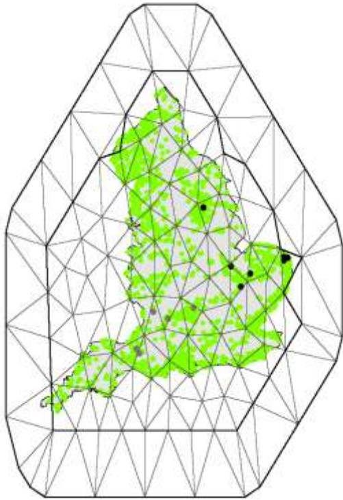
Figure 1: Delaunay triangulation (mesh) over the study area. Green dots represent the 2,526 wetlands in England, black dots the wetlands occupied by nesting pairs from the natural population and grey dots the wetlands occupied by nesting pairs from the reintroduced population in 2015.