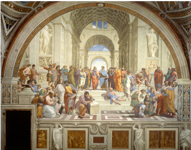
Figure 1. Raphael's celebrated fresco the School of Athens on the wall of Apostolic Palace in Vatican City.

practice and qualifications with others might put their goodwill in danger. Even institutions of the same status can have severe reluctance in joining such a union [4]. For instance, Imperial College London and University College London, two world-renowned universities from England, initiated a merger in a bid to form a large university capable of attracting twice the research fund universities such as Oxford or Cambridge can allure [5]. Although the alliance could help them achieve many benefits, it did not come through due to opposition from management and students of both universities [6].