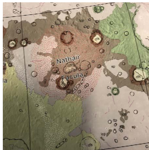
Fig 2 Nathair Facula as shown on the quadrangle map of Wright et al. (2019).