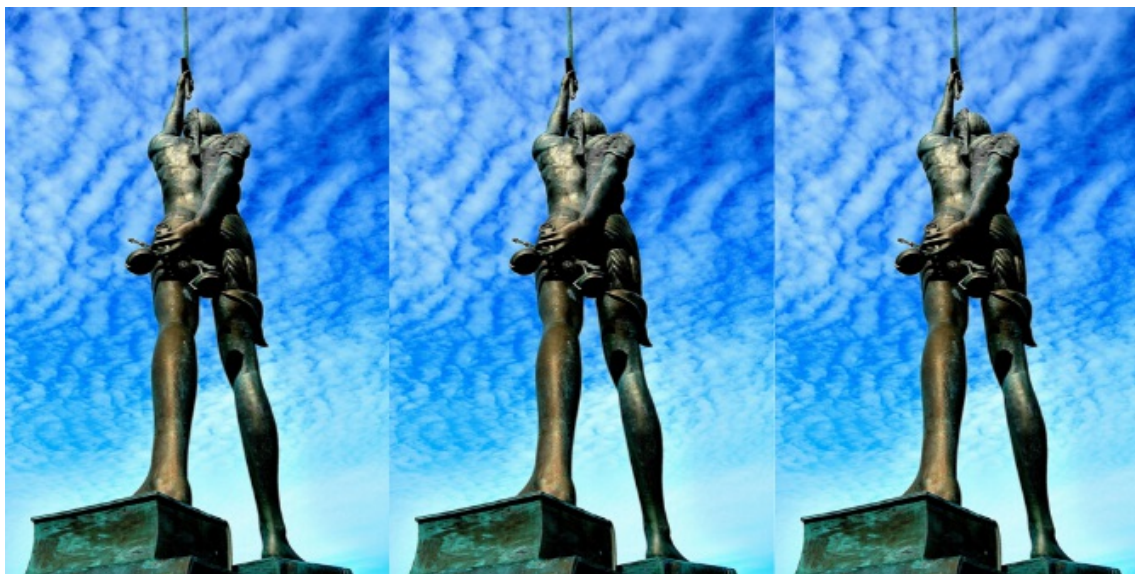
Image Credit: Verity sculpture, Damien Hirst, The Harbour, Ilfracombe, Devon