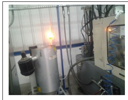
Figure 9. Implementation of poka-yoke: Sensor with alarm.