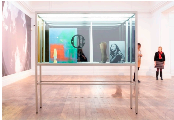
Figure 1. Josephine Meckseper. The Story of Mankind , 2014 (Installation). Mixed media in stainless steel and glass vitrine with fluorescent light and acrylic sheeting.

Meckseper's work (e.g., Figure 1) combines paintings and found objects with her own images and film footage of political protest movements. Her installations and vitrines 'by simultaneously exposing and encasing common signifiers, such as advertisements and everyday objects, next to abstract paintings and sculptures create a window into the collective unconscious of our time.' (Cramerotti 2018). She uses digital media as a tool of production, exhibition and for her films, distribution, to rearrange and interrupt the contextual settings we associate with her found objects and images.