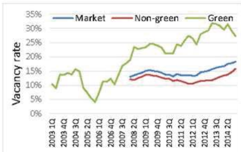
Figure 3: Trend in vacancy rate