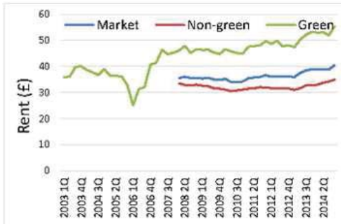
Figure 2: Trend in rental rate