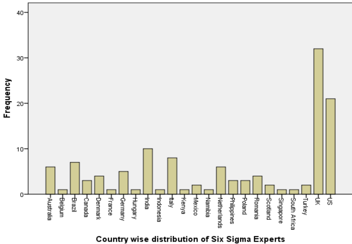
Figure 1: Country distribution of survey participants

Figures 2 and 3 illustrate the distribution of participants in the service and manufacturing sectors. In the service sector, most of the respondents were from consulting and financial services. In the manufacturing sector, the majority of respondents come from the Mining, Automotive, Heavy electricals, Petroleum and Chemicals industries.