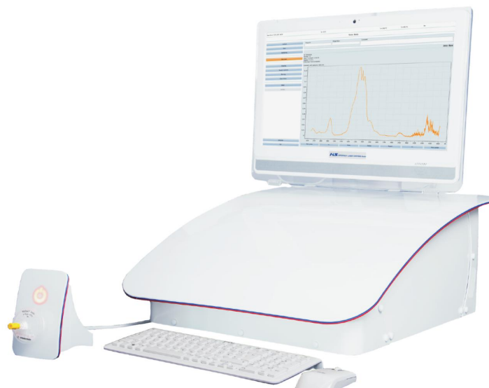
Figure 2. The LaserBreeze gas analyzer appearance