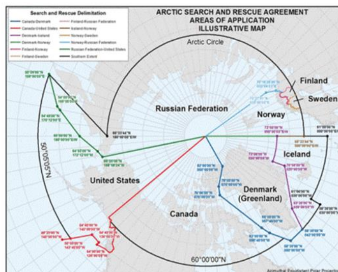
Fig. 2. Map of the Arctic search and rescue areas, the Agreement of 2011 [5]

The bilateral relationships between some Arctic riparian countries are very good organized. But as for the eight Arctic Council member states one of the basic document that regulates their relationships in the Arctic region is the Agreement on Cooperation on Aeronautical and Maritime Search and Rescue in the Arctic (see the Figure 2), signed on May 12, 2011 in Nuuk, Greenland [5].