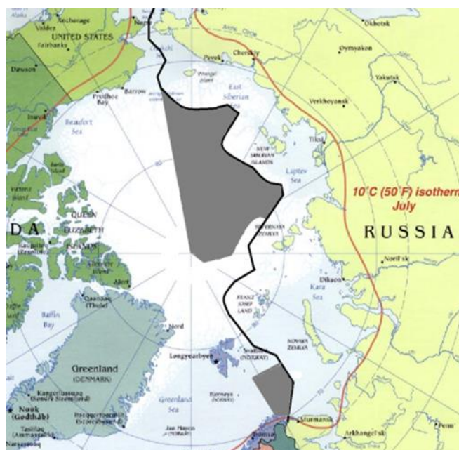
Fig. 3. Russian claims in the Arctic zone [4]

The Arctic zone is a region of high importance for the Russian Federation. Russia has its interests and considerable claims in this region (see the Figure 3). This territory is an extremely significant object of national economic and politics [8]. Russian President Vladimir Putin points out that “our interests are concentrated in the Arctic. And of course, we should pay more attention to issues of the Arctic development and the strengthening of our position” [7].