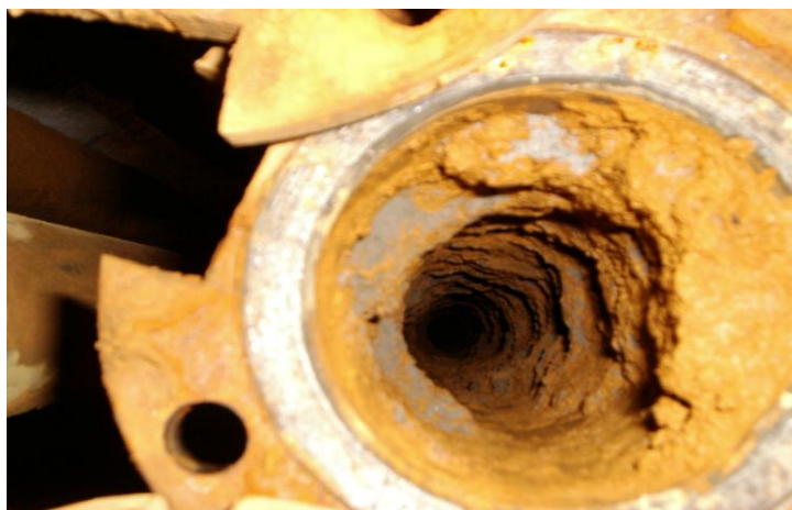
Figure 2. Precipitate in an ascending pipe in well No. 14.

Two morphological types of mineral neocrystallization are formed on the equipment of water intake facilities: structureless ochreous (iron) masses and mineral aggregate having rigid-structured framing. There are no significant genetic differences between these precipitation types: both are formed due to physical-chemical environmental condition changes, whereas their morphological peculiarities are predominantly associated with the hydrodynamic depositional environment [4].