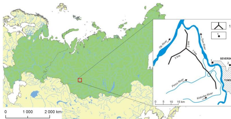
Figure 1. Layout of Tomsk and Seversk water intake facilities: 1 – lines of water intake production wells in Tomsk; 2 – water intake facilities in Seversk.

Operating regulations for analyzing and predicting hydrogeological condition changes within the areas of water intake facilities are stipulated by the monitoring system for groundwater level and quality. Analytical work was performed in accredited laboratories of OJSC Seversk Vodokanal and OJSC Tomskgeomonitring.