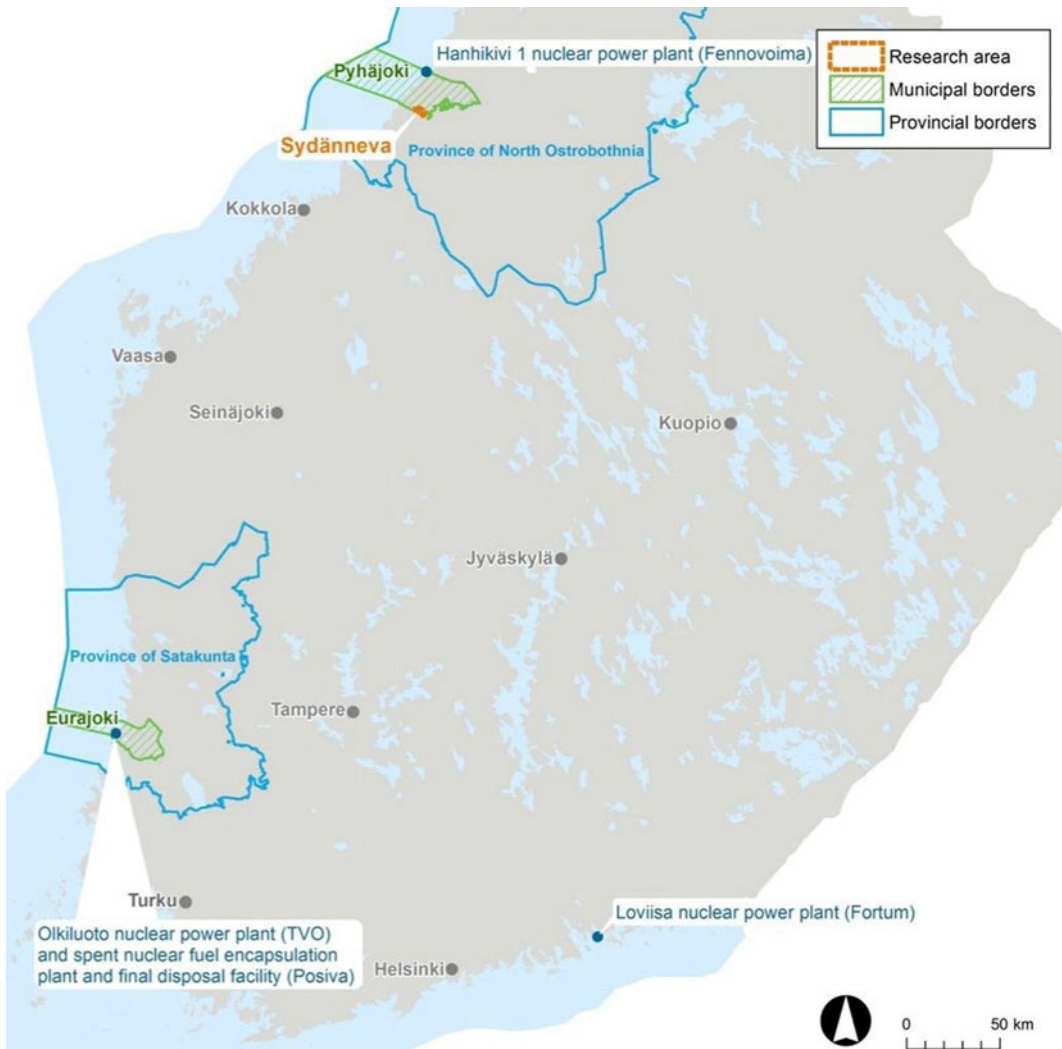
Figure 1. Map of Pyhäjoki and Eurajoki as alternative locations for Fennovoima's SNF repository.

disposal of SNF produced by its owners only, i.e. the nuclear power companies Teollisuuden Voima and Fortum Power and Heat. According to the Finnish Nuclear Energy Act waste management responsibility covering implementation and costs rests with the waste producers, i.e. nuclear power companies. Although Posiva has been exhorted by the authorities and politicians to collaborate with the nuclear power company Fennovoima, Posiva has so far agreed to provide Fennovoima with expert services only, but has refused the joint national final disposal at Olkiluoto site in Eurajoki (Kojo and Oksa 2014).