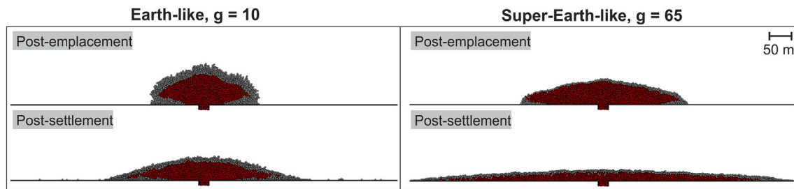
Fig. 3. Cross-sections of modelled domes (post-emplacement and post-settlement) for an Earth-like planet with g = 10 \text{ m/s}^2 , and a Super-Earth-like planet with g = 65 \text{ m/s}^2 .

currently unconstrained for exoplanets, but could be incorporated into future models to indicate detailed morphology on specific exoplanets. The associated rock strength of the solid outer shell of the dome or talus, maintained constant in the simulations presented here, will also influence dome morphology, particularly during settlement. This is because a dome constructed using weaker, perhaps hydrothermally altered (e.g., López and Williams, 1993; Finn et al., 2001), rock is more likely to experience mass wasting.