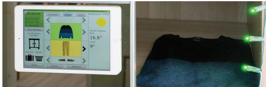
Figure 3. On the display the sweater is marked in green as well in the wardrobe.