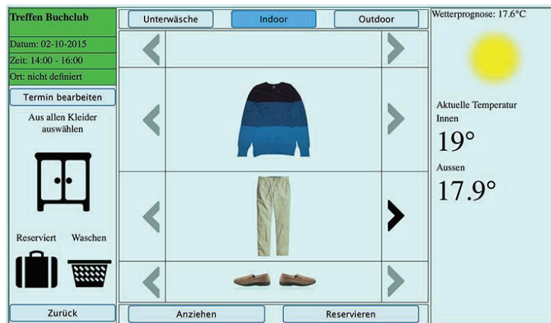
Figure 2. Display with the clothing suggestion and the current weather condition.

At the heart of the work is the wardrobe in the bedroom. The tablet PC on the front door displays a summary of the appointments for the day, the inside temperature, the current weather conditions and the forecast. If a calendar entry is tapped, an appropriate clothing proposal is generated using the following data (figure 2): The current temperature in the apartment, the actual outside temperature, the weather forecast and the nature and duration of the event. The user receives a suggestion for clothes that are suitable for the chosen occasion and conditions. For appointments outside the apartment, the outerwear is calculated accordingly. If the user doesn't like the proposal, he/she can browse through more clothing suggestions. The system remembers in a learning algorithm whether certain garments are chosen more often and recommends their use more frequently.