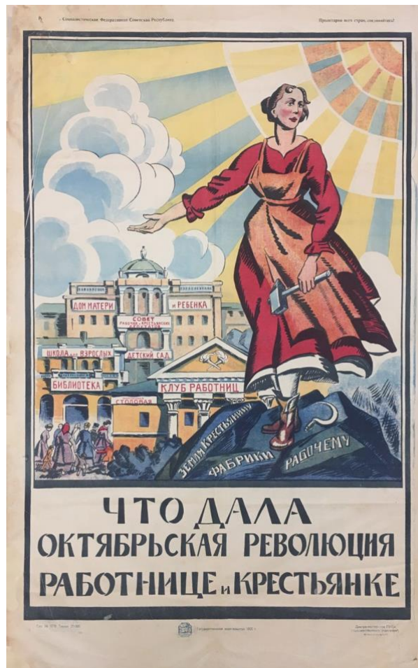
"What the October Revolution has given to women workers and peasants." This 1920 poster from the Russian Soviet Republic shows a woman gesturing towards a library, workers' club, cafeteria, school for adults, kindergarten, and home for mothers and children.

The interesting thing about the present moment, including the Trump moment, is that the first kind of feminism I mentioned is in crisis. The defeat of Hillary Clinton was a huge wake up call and a crisis for contemporary feminism as it was for progressive neoliberalism more broadly. That means we actually have an opportunity now to really develop and strike out in a different direction. That's what I mean by the fork in the road. Either we try to put humpty dumpty back together again and recreate this liberal feminism which is allied with neoliberalism or we say “basta, enough of that” and we develop a new left-wing feminism of the sort I've described. The name we've given to the second, drawing on the language of Occupy Wall Street, is Feminism for the 99%.