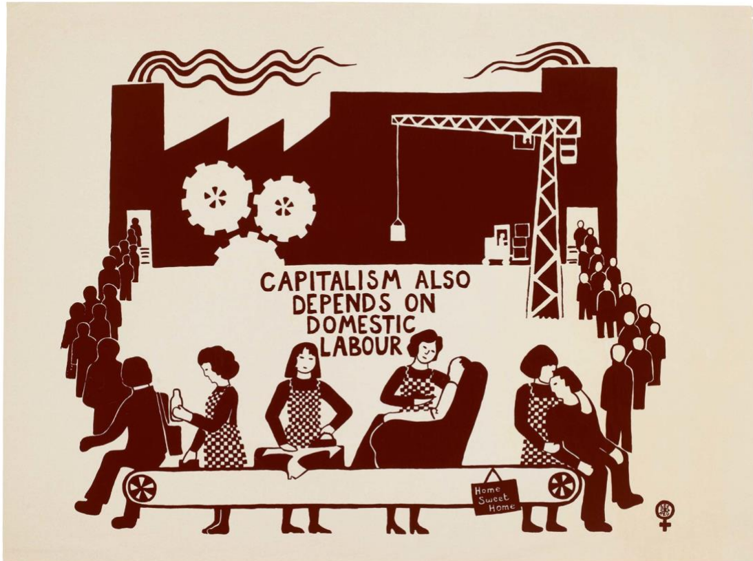
“Capitalism Also Depends on Domestic Labour.” Source: See Red Women's Workshop: Feminist Posters 1974-1990.