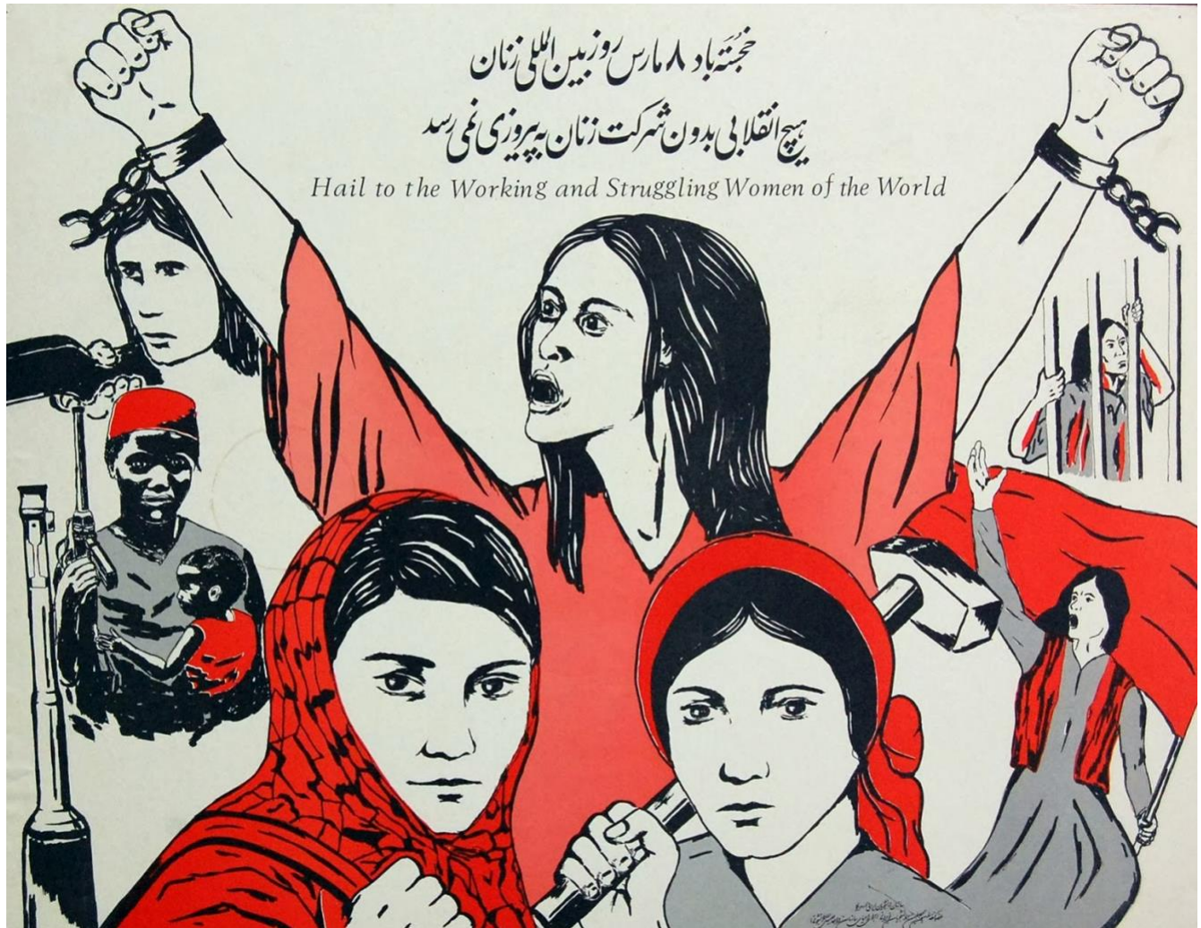
“Hail To the Working and Struggling Women of the World.” Published by the Iranian Students Association in the U.S. (Berkeley, CA). Circa 1979.

antithesis is not functioning in the same way anymore. I don't know whether this can be translated into an actual world-view that could be persuasively explained to organize international solidarity, coalitions, and movements, but I think there is at least a possibility. As bad as things are, and they really are terrible, I'm seeing some glimmers of possibility and that's one of them.