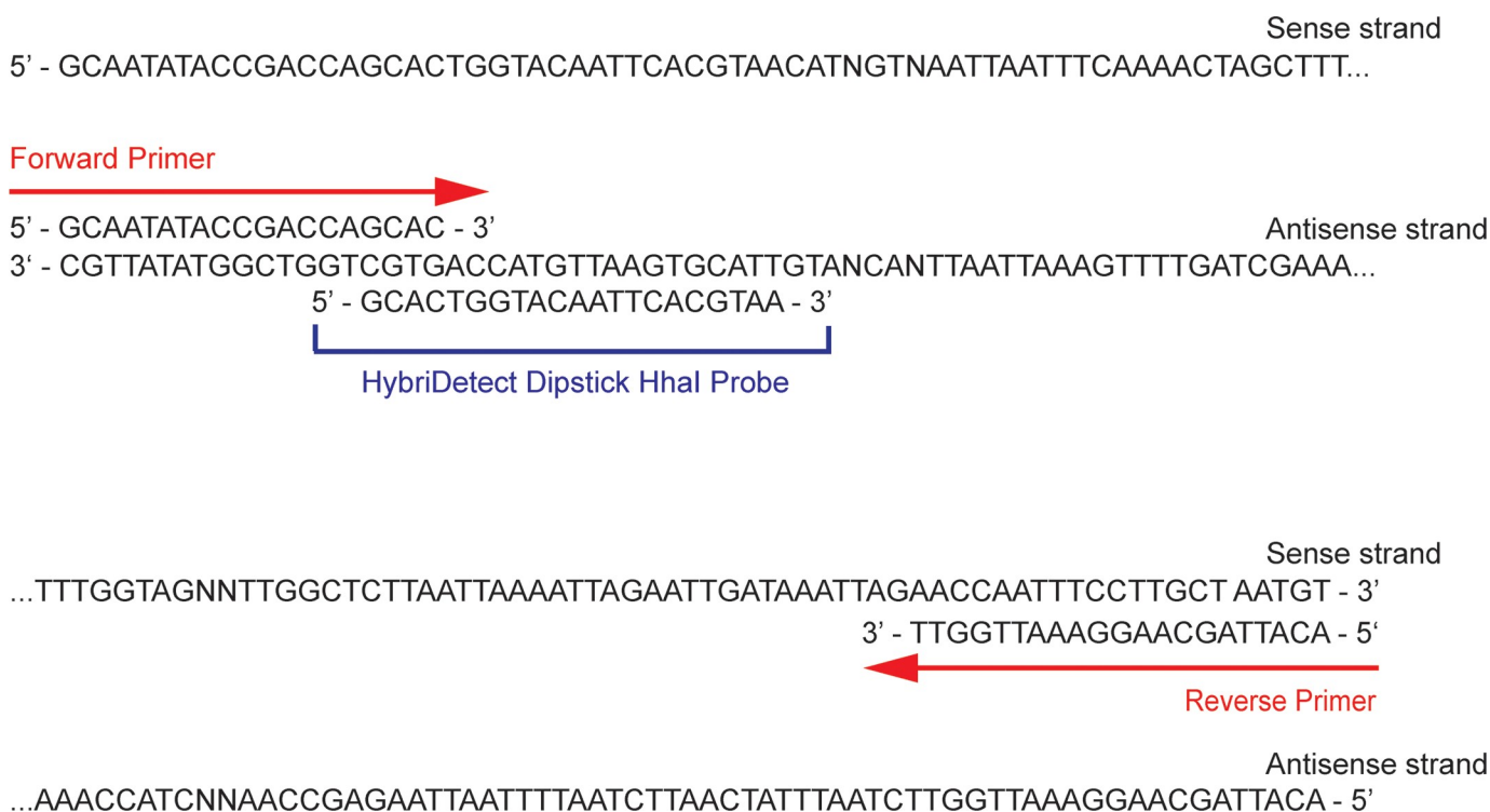
Fig 1. B. malayi HhaI repeat DNA sequence used for test strip-based detection. The sequence of B. malayi DNA that is amplified from the HhaI repetitive target is illustrated. Both the forward and reverse primer sites, as well as the location of the hybridization probe are indicated.

Probe hybridization and test strip detection. Following conventional PCR amplification of each sample using both the standard PCR and the miniPCR instruments in parallel, the 5'