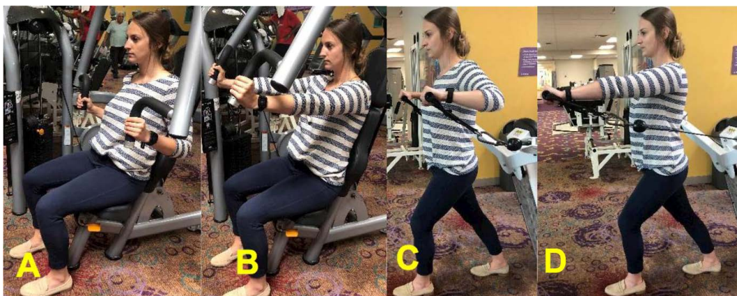
FIGURE 7. Chest press exercise can be modified to accommodate specific back movement limitations. (A-B) A version of a seated machine chest press for persons with extension intolerance (A, starting position; B, pushing motion). (C-D) An adjustable cable column version of a standing chest press exercise for persons with flexion intolerance (C, starting position; D, pushing motion).

Low back pain is a common musculoskeletal disorder affecting approximately 38% of new outpatient cardiac rehabilitation patients. The majority of LBP is considered chronic and nonspecific. Cardiac rehabilitation patients who have CNSLBP can obtain the same improvements in physical activity tolerance, physical function, and HRQoL as persons without CNSLBP. A comprehensive, individualized approach to developing exercise programs that