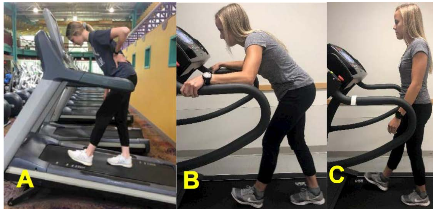
FIGURE 2. Treadmill walking. (A) Pain can occur during inclined walking from compensatory trunk flexion in a person with flexion intolerance. (B) Pain during prolonged walking and compensatory trunk flexion in a person with extension intolerance. (C) Walking on a level surface may be best tolerated by persons with flexion intolerance. Those with extension intolerance may do better with some incline or, if necessary, by substituting seated or recumbent exercises for treadmill walking.