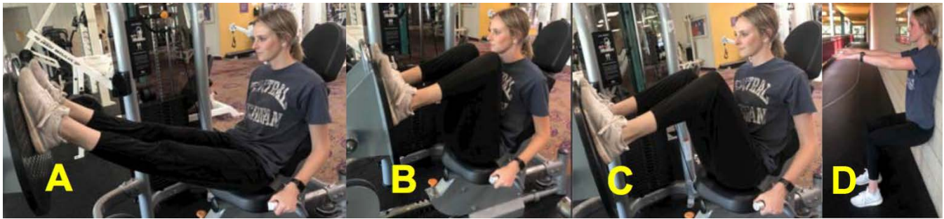
FIGURE 4. Seated leg press is a well-tolerated multi-joint lower body strength exercise option for persons with extension intolerance. Improper seat positioning can worsen back pain. (A) Overextension of the knees and overreaching during the end of the pushing phase of the leg press can exacerbate low back pain in persons with extension intolerance. (B) The knee to chest position is a form of spinal flexion which might need to be modified for persons with flexion intolerance. (C) Sitting fully against the back seat pad will ensure vertical alignment of the head, neck, back, and hips, and support a more neutral spine. An alternative can be either a supine leg press (not shown) or (D) a standing wall squat, with or without a stability ball behind the back (D, proper alignment at the bottom position). The wall squat performed with a stability ball is an alternative to the leg press for persons with flexion intolerance.

An initial training intensity that is equivalent with an RPE of 12 to 13 (out of 20) or 4 to 6 (out of 10) on the OMNI RES scale is appropriate and, if tolerated, may be progressed over time (1,3,5). Although single set RT programs