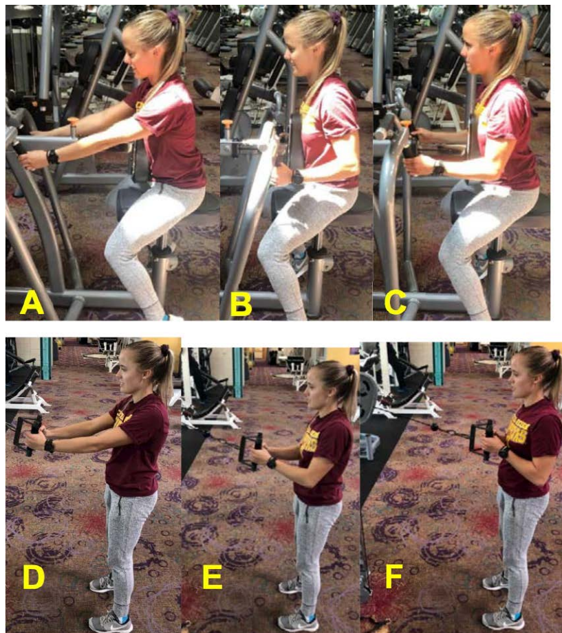
FIGURE 5. Rowing exercises can be modified to accommodate specific back movement limitations. (A-C) A version of a seated machine row for a person with extension intolerance (A, starting position; B, pulling motion; C, returning to starting position). (D-F) An adjustable cable column version of a standing row for persons with flexion intolerance (D, starting position; E, pulling motion; F, finish position).

have produced significant strength increases in sedentary, untrained individuals (92), progressing to a protocol consisting of 2 to 4 exercise sets per muscle group is recommended as tolerated (2,3,92). Periodized, progressive,