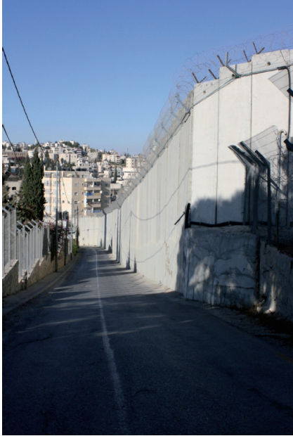
Separation wall, separating Ras Al-Amud from Abu Dis

complexities and contradictions into the urban landscape that are not consistent with Israeli political objectives.