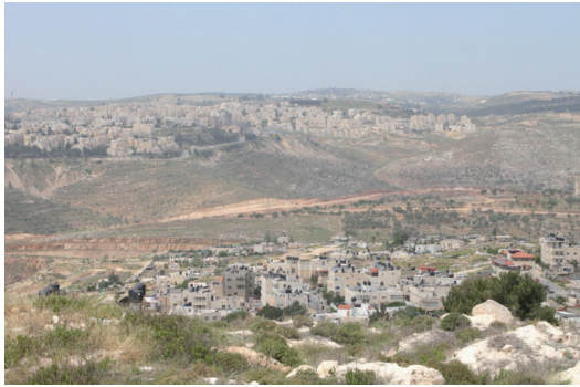
A view from Beit Hanina showing an Israeli settlement and a Palestinian built-up area

of territory to solidify Israeli claims of political control. The barrier cuts off thousands of Palestinian residents from the city, and even cuts into Israel's designated Jerusalem municipal space in a few cases.