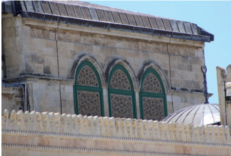
Fatimid Engraving.

This article aims to investigate whether the Fāṭimids played a role in adding new constructions in Jerusalem or in affecting its intellectual and social life. The researcher consulted historical sources to determine whether the Fāṭimids had erected new institutions or contributed to Jerusalem's cultural activities. Before tackling the issue of contributions, this paper will begin