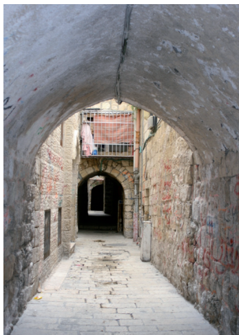
An Alley in the old city of Jerusalem

A band of itinerant musicians and dancers hired by a Persian king? A caste of entertainers, commissioned to defend their homeland against a Hunnish invasion in the 5 th century? Or a number of tribes sent out to Persia to a Turko-Persian general, never to return again? How and when did the Gypsies begin their migration, and how did they end up in Jerusalem of all places? In the early 18 th century, historians established that the Gypsy people originated as a caste of entertainers in India who called themselves Dom, which meant “man” in their common language. The Dom of Jerusalem are one of the many communities of Gypsies who have settled throughout the Middle East. Like the Roma and Lom, their European and Armenian counterparts, the Dom have a consciousness that is both uniquely Gypsy