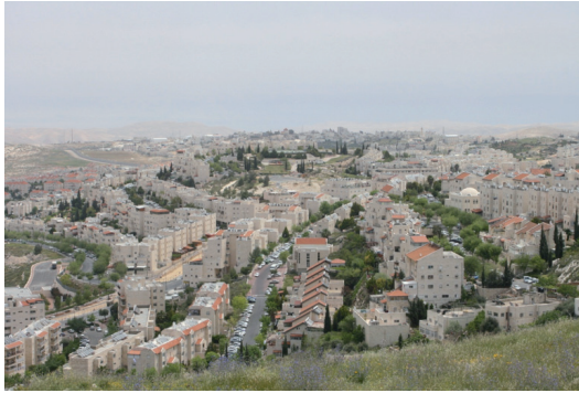
The Israeli Settlement of Pisgat Zeev

There are plans in Arab East Jerusalem that are theoretically meant to guide development, but they are used by Israeli authorities instead to restrict and control, with constraints on outward growth (blue lines), open space, and future urbanizing designations, and restrictions on building volume. Further hindrances to Palestinian