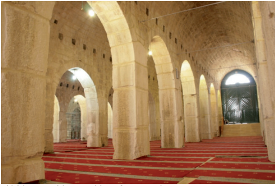
Al-Marwani Mosque-View from inside

Israeli opposition, involving running battles with the police, legal petitions by pressure groups, and critical reports by the Israeli Antiquities Authority. 1 Nevertheless, the rehabilitation work greatly enhanced the standing of both the Islamic Movement and the Waqf Administration in the Islamic world. 2