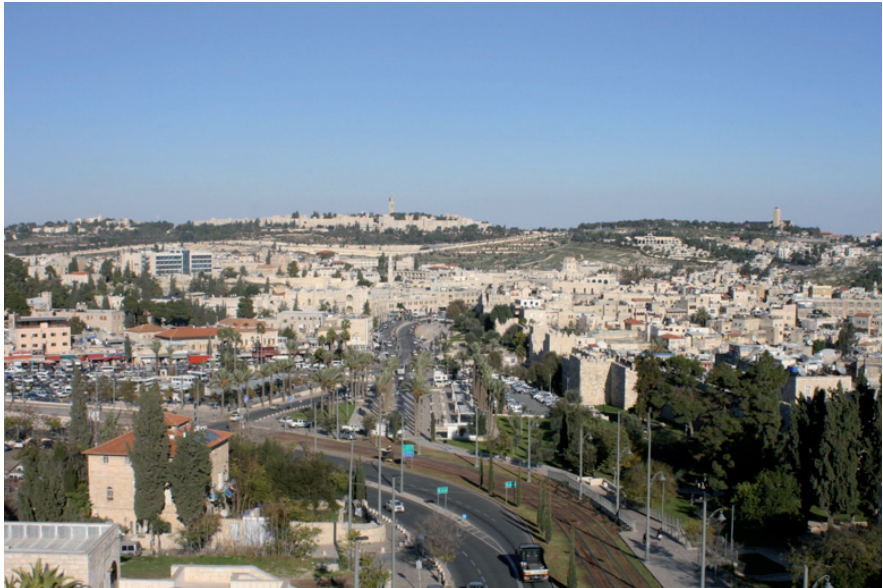
Junction between Sultan Sulaiman Road and Road number 1

July 2016 marks the 16 th anniversary of the start of Camp David negotiations between Israelis and Palestinians, mediated by the United States. The resulting failure reversed years of incremental advances in bridging the gap between Israelis and Palestinians and put an end to a period of hope that the conflict was on its way to resolution. No single issue was more responsible for the failure than that of Jerusalem.