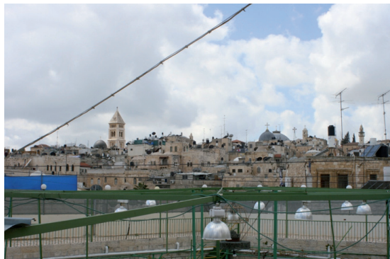
A view of the old city of Jerusalem

vid was the issue of Jerusalem, even if other important issues such as refugees, borders, and Israeli settlements remained unresolved. This was particularly ironic as Jerusalem was the single issue over which there was no previous discussion or any serious preparation – not that the centrality of the issue was unpredictable. It is also striking how the American team had limited information about the Palestinian or the Israeli bottom line positions, particularly with regard to Jerusalem.