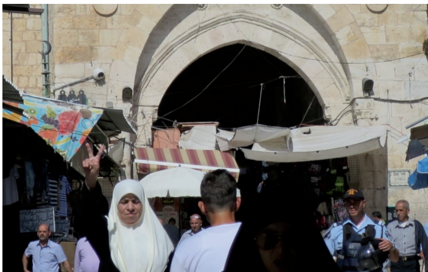
People and Israeli Security forces inside Damascus Gate

Amid continued political impasses over the past 20 years, what have been the spatial trajectories of change in Jerusalem? How has the city under partisan occupation evolved spatially, politically, psychologically, and economically? Based on field research in 1994 and more recently from October 2015 to February 2016, here is what I have observed.