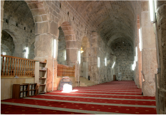
Al-Marwani Mosque-View from inside

In the midst of recent tensions and controversies surrounding the access of non-Muslims to the Haram al-Sharif, observers and researchers may have overlooked the significance of a remarkable achievement that has occurred in Jerusalem: the restoration and rehabilitation of Mussala al-Marwani, or the Marwani